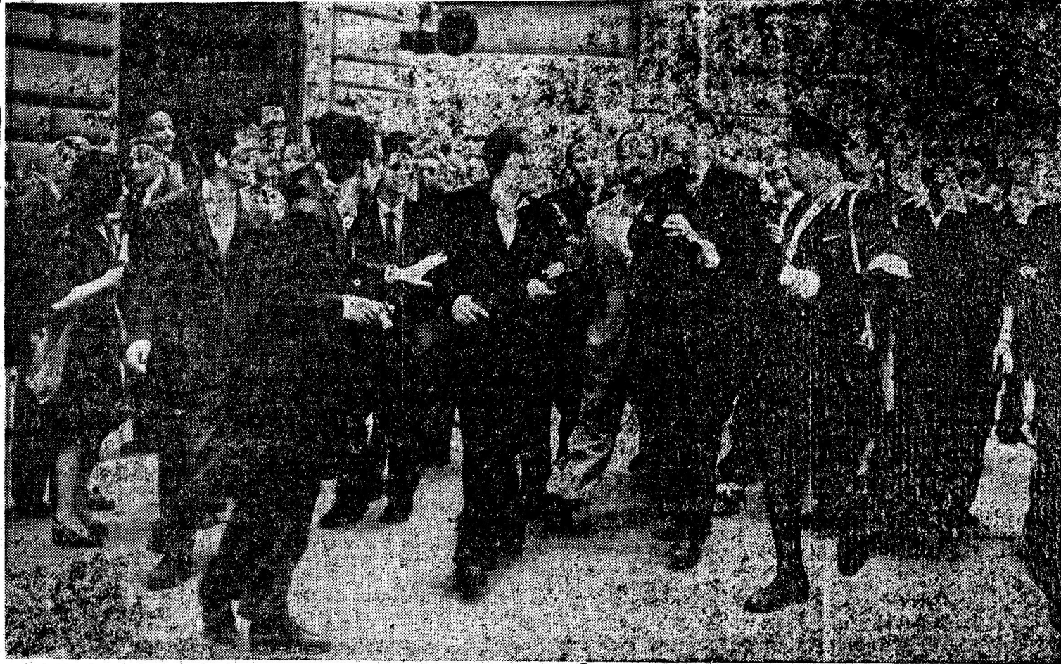
The remarkable picture above shows anti-fascist workers in Rome rounding up known fascist leaders and marching them through the city streets. One captive, folding his hands in a pleading gesture, his face screwed up into a tearful expression, demonstrates the craven fear of the fascists before the wrath of the workers.

to the approaching Nazi troops, and then opened the way for the unimpeded entry of the Nazi reinforcements.