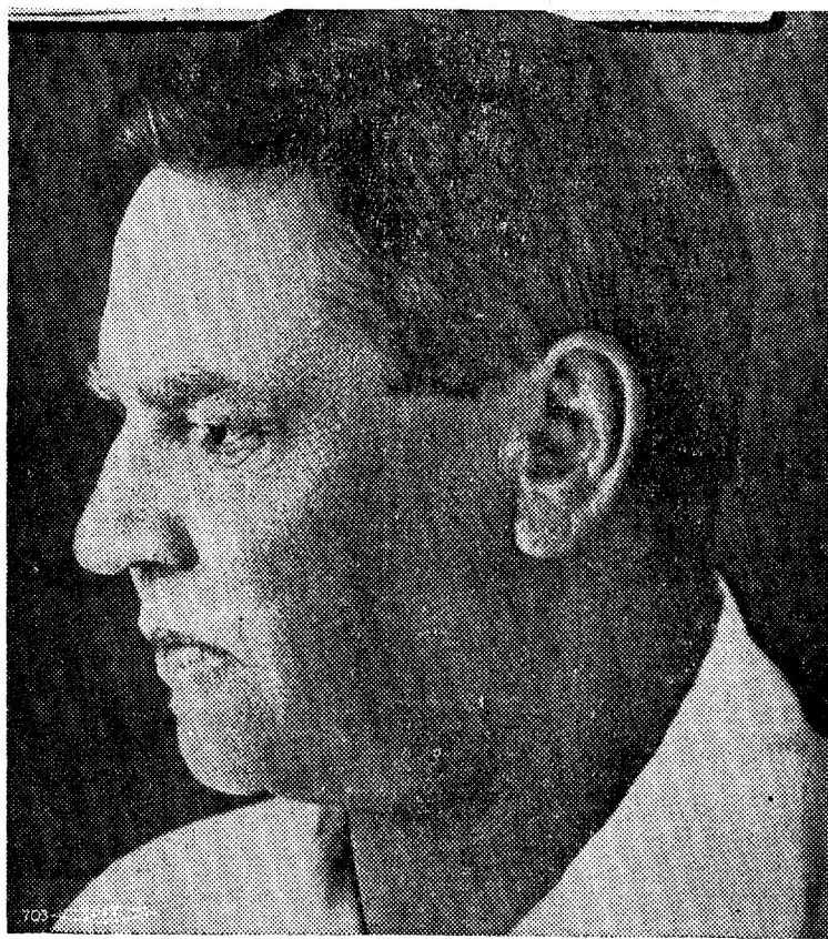
William Haywood, 1869-1928

The death of Haywood was not unexpected. The declining health of the old fighter was known to his friends for a long time. On each visit to Moscow in recent years which our Party work necessitated we noted the progressive weakening of his physical powers and learned of the repeated attacks of the fatal disease which finally brought him down. Our anxious inquiries during the past month, occasioned by the newspaper reports of his illness, only brought the response that his recovery this time could not be expected. Nevertheless we could not abandon the hope that his fighting spirit