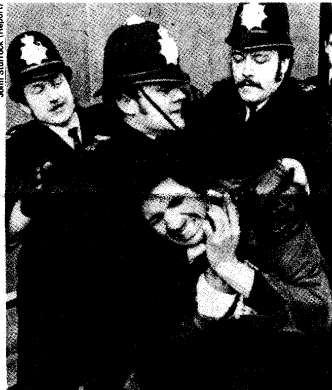
Cop terror in Southall, April 23, 1979

Since the first SPG unit was formed in London in 1965, it has become a 'quasi-military', 'quasi-independent' force 'brought in to ... help in policing industrial disputes and demonstrations' as the Unofficial Committee of Enquiry report puts it. From Grunwick to Southall, the SPG has justifiably earned its reputation for brutality. More importantly, the esprit de corps and 'quasi-independence' of its units reinforce dangerous tendencies toward police bona-