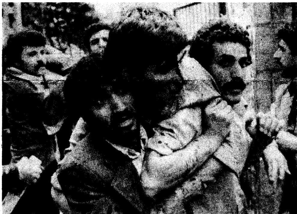
Leftist students after Islamic thug attack. Fake-Trotskyist HKE claims the Islamic fanatics were 'revolutionising' the universities

Now the SWP/HKE have outdone their factional competitors in the USec, carrying their criminal support to Khomeini's 'Islamic revolution' to its logical conclusion. They hailed the bloody purge of leftists on the universities and de-