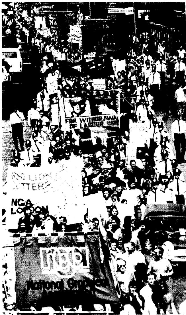
Print workers march down Fleet Street on May 14. Murray & Co's 'answer' to the Tories was only one half-hearted 'day of action'

Yet the union bureaucrats cannot easily hold back the growing resentment and hatred of this government in the working class. It is this