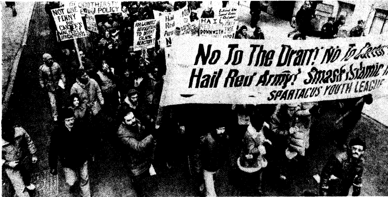
Spartacus Youth League contingent at New York anti-draft demonstration in February: winning youth to Trotskyism

'It does not bode well for the future of Iran that the majority of the international left has been unable to distinguish between a deepening process of permanent revolution and a rise in irrational fanaticism serving to consolidate the rule of a repressive and reactionary theocracy.' ( Socialist Challenge , 7 February)