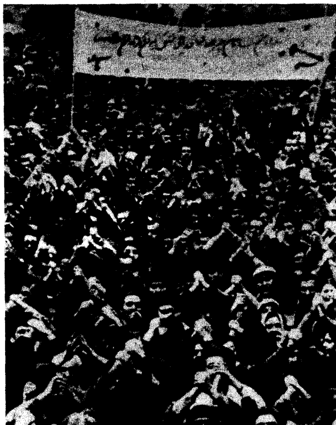
Fedayeen rally at Teheran University, February 1979

Although Fedayeen spokesmen in Teheran attempted to deny that the mullah-run Abadan