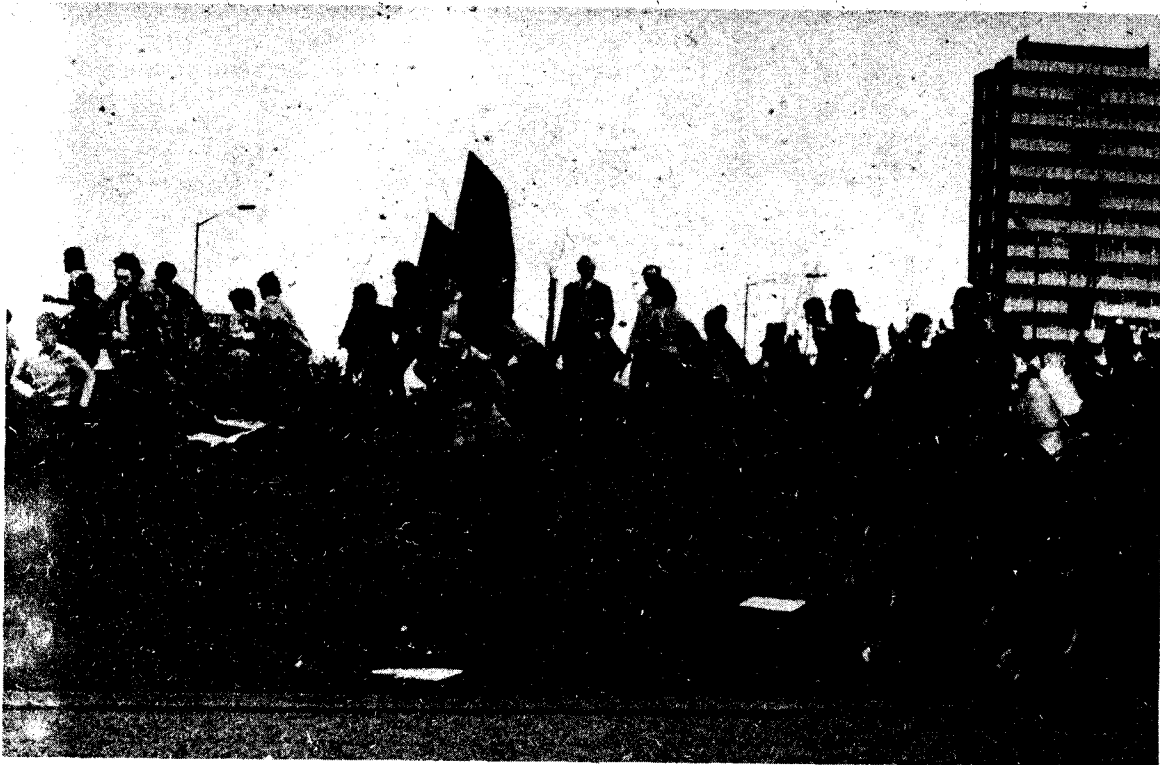
Mounted police charge anti-fascists, West Bromwich, April 28