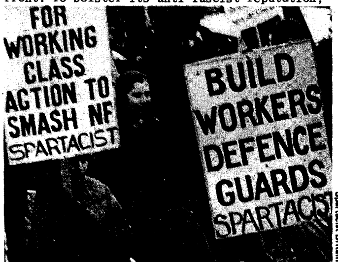
Spartacist contingent in April 28 Southall march to protest cop killing of Blair Peach

By its very nature as a popular-frontist alliance with bourgeois 'personalities' and labour bureaucrats, the ANL cannot be a long-term organising focus for street fighting -- let alone an organisation which can actually turn out tens of thousands of disciplined workers to crush the Front. To bolster its anti-fascist reputation,