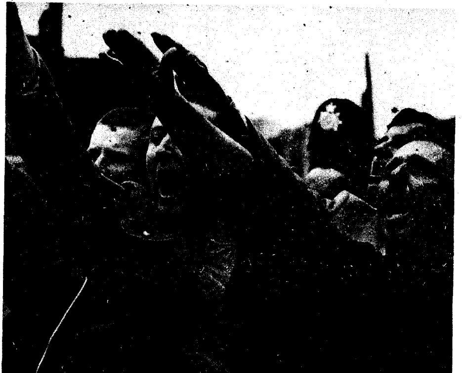
NF scum give Hitlerite salute during East End anti-fascist march, April 29