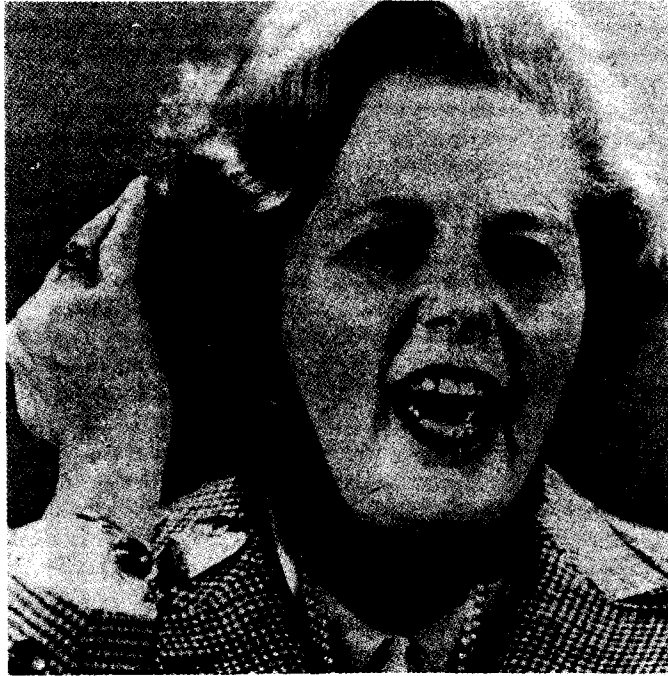
Thatcher: 'now for the unions'

However they were still worried. After all, the last Tory attempt to tame the unions was Heath's confrontation with the miners in 1973-74 -- and that was a catastrophic failure. Moreover the stridently right-wing Thatcher makes the Heath of 1972-74 seem a reasonable moderate by comparison. The authoritative bourgeois Economist came out for a Tory vote, but only after stating that Callaghan stood on a fine line between 'middle-ground conservatism' while Thatcher was too dangerously radical and confrontationalist. Now she is in power, surrounded