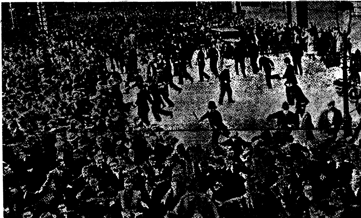
Cable Street: police thugs try to clear way for Mosley's Blackshirts

'The only final way of defeating fascism is the overthrow of capitalism, but this is not to say that the workers should ignore the fascist bands at the present time. On the contrary, the smashing of every manifestation of fascism is an essential part of the class struggle. Every blow delivered at the open fascist formations is a blow against capitalism itself. To do this one does not appeal to the patriotic sentiments of the middle class but to the organised strength of the workers who alone are capable of overthrowing capitalism. Through their organisations the workers must form their own defence corps which can organise the mass hostility against fascism and drive the blackshirts off the streets.... Not by competing with the fascists in patriotic demagoguery will we attract the lower ranks of the middle class to our cause but by the pursuing of a vigorous working class policy.' ( The Militant , August 1937)