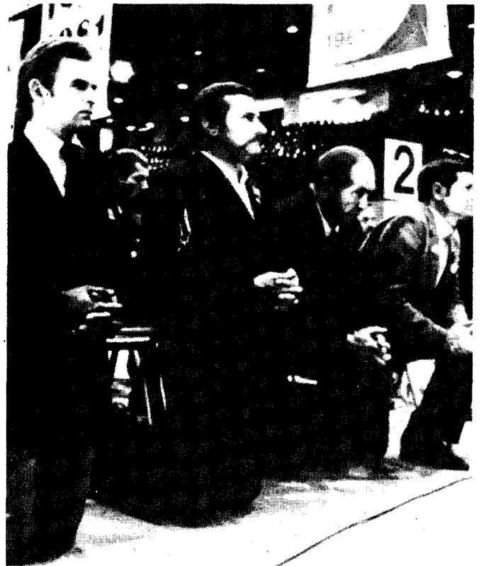
UPI Solidarity congress: leaders kneeling to reactionary Catholic church.

Over and above the formal actions of the congress, the whole activity and spirit of Solidarity is that of an organization making a bid for power. A few weeks