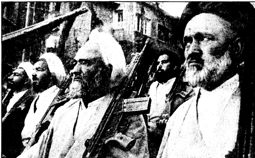
The soldiers of Islam. Mullahs armed for the slaughter of the left and workers movement.

While they differed in emphasis, linking the WCP and IS! is the same anti-Marxist program, based on the "theory" of the "two-stage revolution" which subordinates the interests of the working class and its political independence to the "democratic," "progressive" or "anti-imperialist" bourgeoisie. This led to bloody defeats from China in 1927 to Chile in 1973.