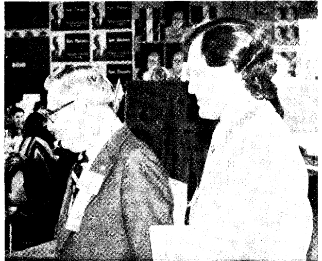
DAVID LEWIS & SON: EXIT STAGE LEFT?

The three candidates for party leadership were all so right-wing that no one was able to uncover any substantial differences between them. All upheld