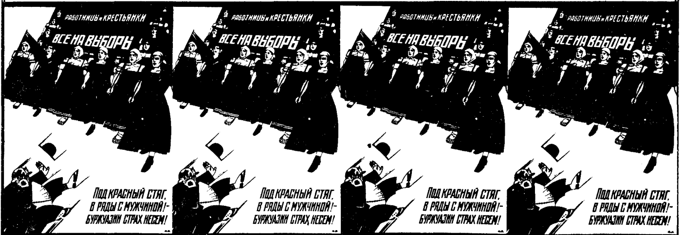
"TOGETHER WITH THE MEN WE WILL THROW OUT THE CAPITALISTS"--1920's RUSSIAN POSTER

Bourgeois feminists may celebrate it, but March 8--International Women's Day--is a workers' holiday. Originating in 1908 among the female needle trades workers in Manhattan's Lower East Side, who marched under the slogans "for an eight hour day," "for the end of child labor" and "equal suffrage for women," it was officially adopted by the Second International in 1911.