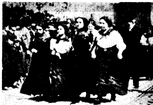
Amalgamated Clothing Workers