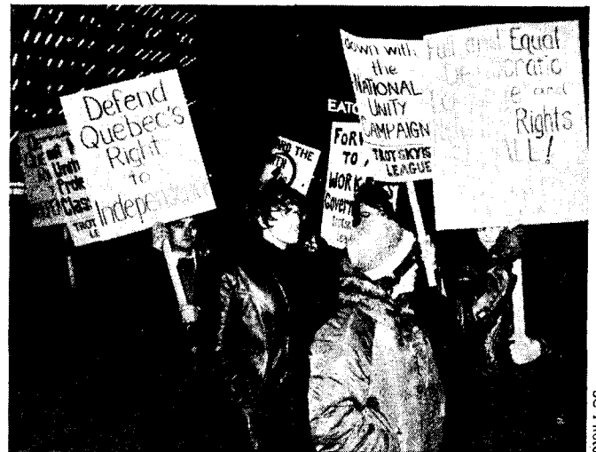
TROTSKYIST LEAGUE CONTINGENT AT TASK FORCE PROTEST

The Canadian Party of Labour's International Committee Against Racism and the bizarre Albania-loyal Communist Party of Canada (Marxist-