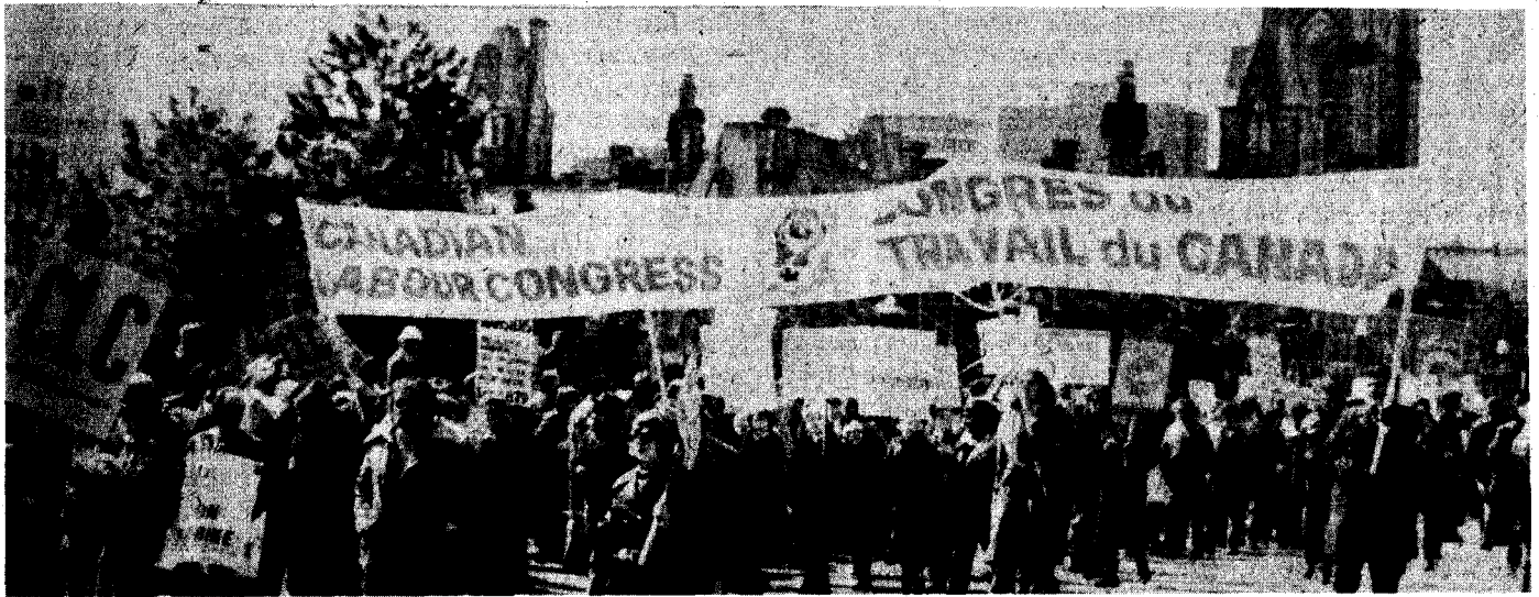
FRONT OF CLC CONTINGENT AT MARCH 22 DEMONSTRATION IN OTTAWA