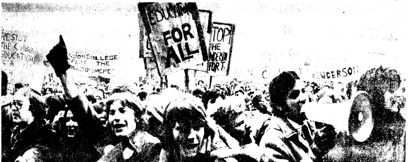
STUDENTS DEMONSTRATE AGAINST CUTBACKS AT THE ONTARIO LEGISLATURE, JANUARY 21.

The Henderson Report's recommendations are an (continued on page 6)