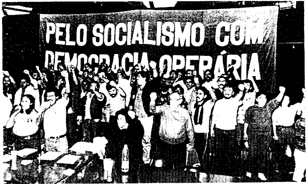
The platform at the Brazilian rally. There were so many on the platform because all the party activists who had been leaders of recent strikes, trade union leaders or council leaders were invited onto the platform.

no longer in the central committee were not capable. This was a synthesis of our rapid growth and the development of team work.