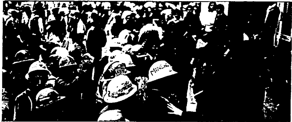
Peruvian miners protest against the low level of wages

Miners earn only £2.00 a week, and have a life expectancy of just 40 years.