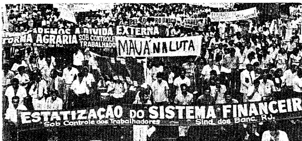
A large demonstration led by bank workers of Rio De Janeiro, calling for a financial plan controlled by workers. Bank workers are one of the three most militant sections of the Brazilian working class

In a recent poll the union institution came out as the second most respected in the country, the government is the most respected but the CUT is the second. Workers have confidence in their unions. The unions may play a great role in the Brazilian revolution."