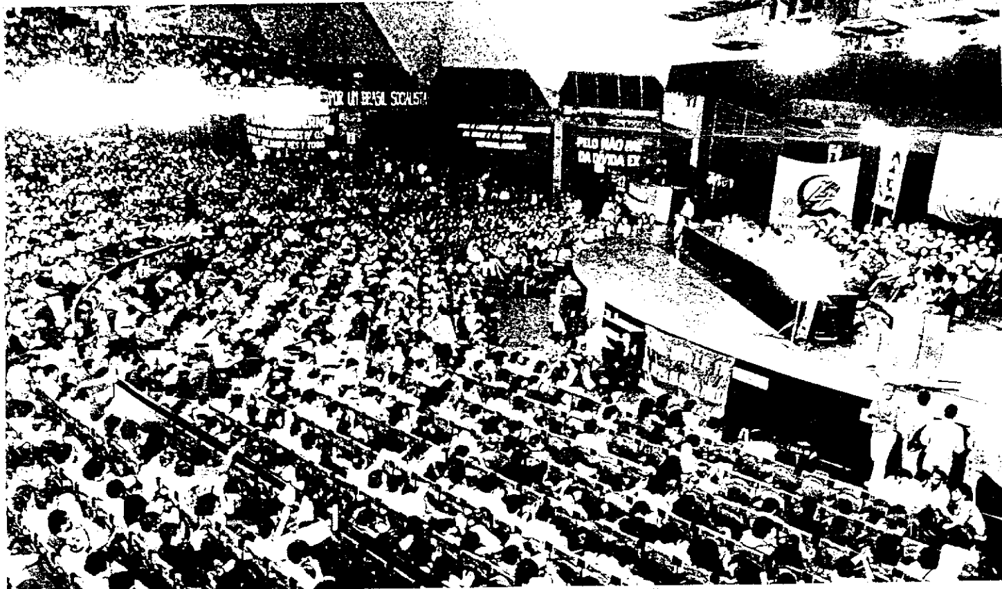
Over 3,500 attended the rally of the Brazilian Section of the IWL (FI), Convergencia Socialista . This meeting preceded the highly successful Brazilian Congress.