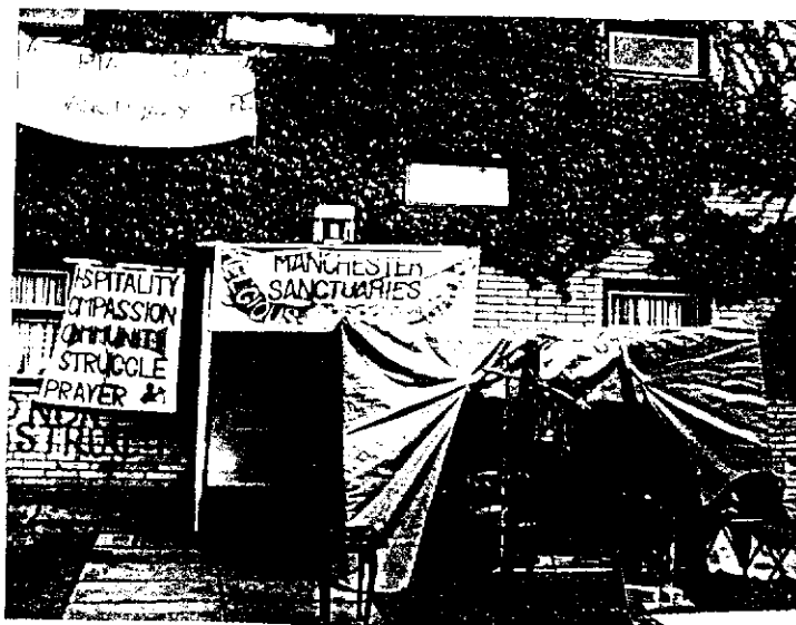
Victoria's House as sanctuary

SV: "On what grounds are you fighting the deportation case?"