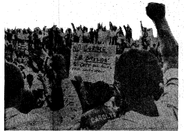
Black demonstrators in Louisiana protest shipment of chromium ore from Rhodesia. Ship was forced to anchor 50 miles up the Mississippi River.

The Pearce Commission has left Rhodesia and returned to London. The Commission is to report on the black Rhodesian reaction to the proposed Anglo-Rhodesian settlement proposals. It is expected to report against the settlement. However Rhodesia is now openly selling minerals to the United States. After the Anglo-Rhodesian settlement was signed in November, foreign businessmen arrived and many new and significant deals have been concluded. It is not expected that a "no" from the Pearce Commission will reverse this.