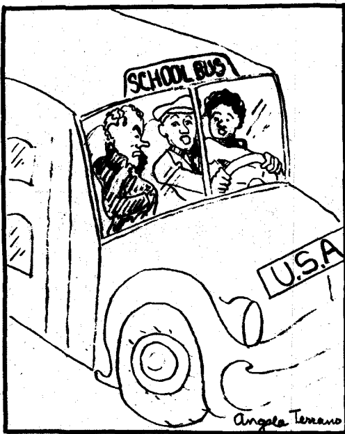
"Take us back to 1954, I'm hijacking this bus."