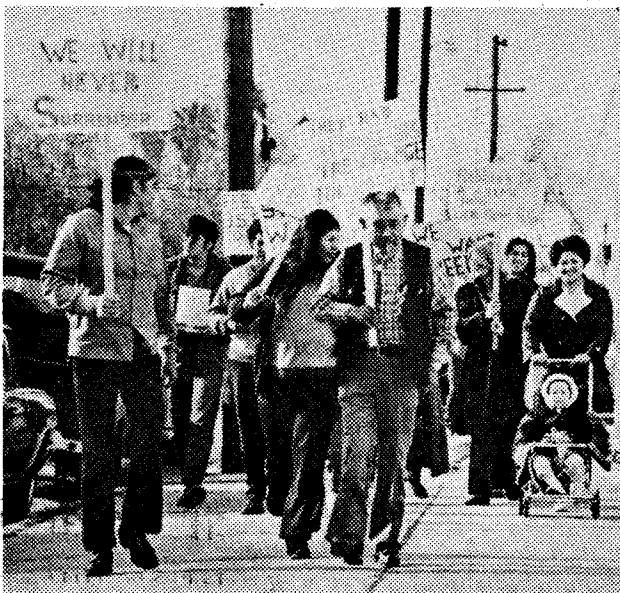
Pit River Indians Protest Trial

And the coal operators and their political lackeys in state capitals will go on as before. There will be more mine explosions, more dam bursts, more blasted lives and families. It will be this way so long as the coal operators have all the power and money and the people have only their hands to work with and to hold out for help when they can no longer work.