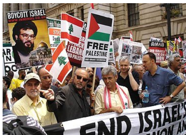
George Galloway second left; Tariq Ali is far right

Respect as we have known it for the last four years, based on an alliance between the SWP and George Galloway, is over. Following the decision of the SWP central committee last Wednesday that the Respect conference would go ahead as planned and unchanged - in other words on a completely undemocratic basis - 19 members of the non-SWP part of the National Council have issued a call for an alternative conference that on the theme of "Respect renewal". Work is going ahead to build it on the broadest basis possible.