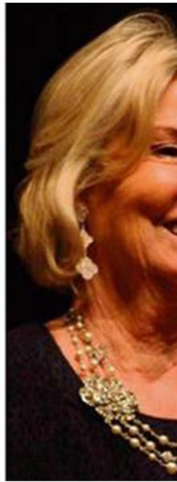
Ireland's richest - Pollonji Mistry, Hilary Weston and Denis O'Brien

The amount of wealth owned by Ireland's super rich is so vast that it's very difficult for ordinary people struggling to make ends meet to get their heads round the figures. If you are just getting by on 20,000 a year someone earning 150,000 looks pretty rich but they are in the ha'penny place compared to the really wealthy.