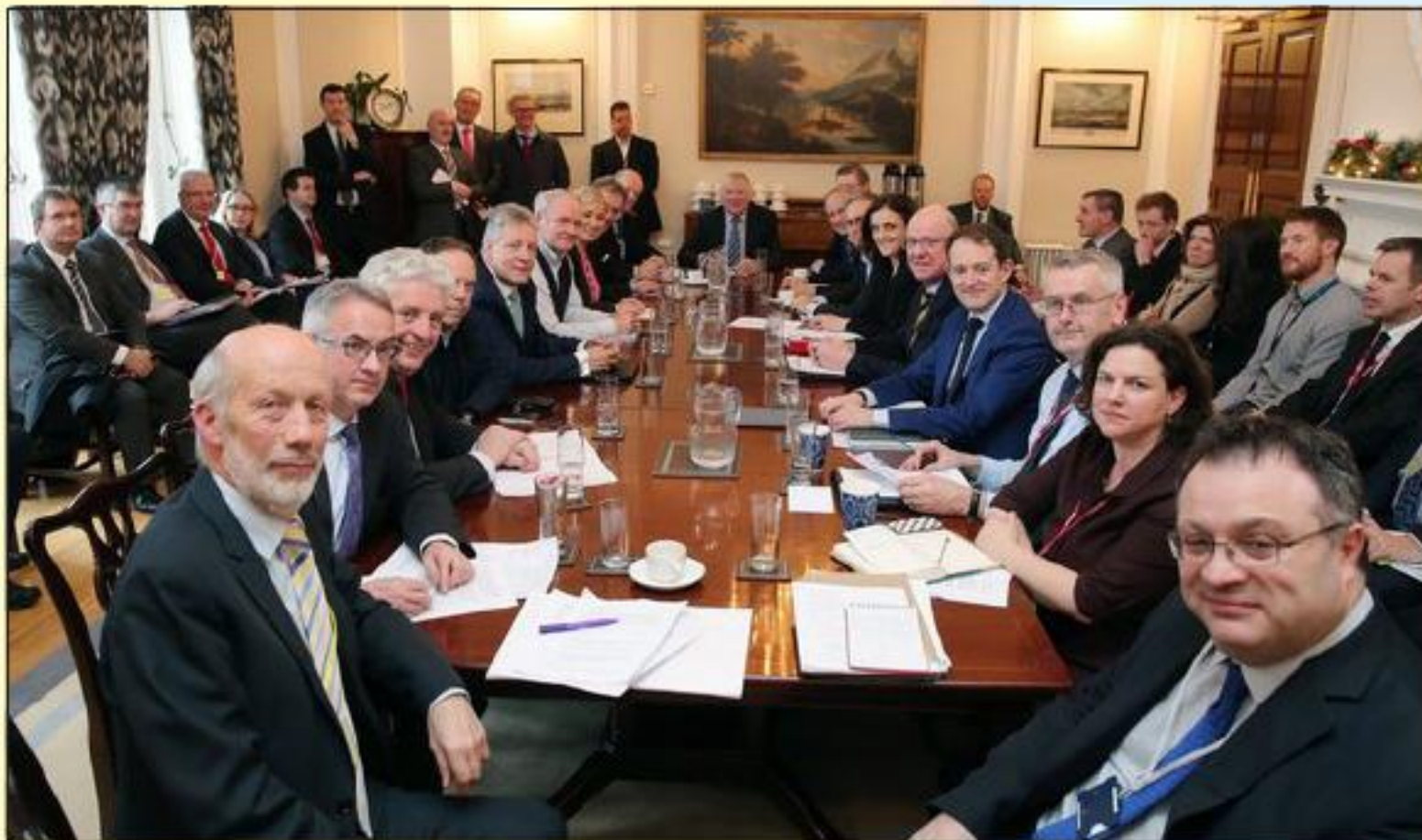
"Broad agreement" has been reached in talks between the five parties in the Stormont power-sharing administration.

"The dam has burst after years of pressure from Westminster. There is now nothing else to cut without doing permanent damage to our social fabric.