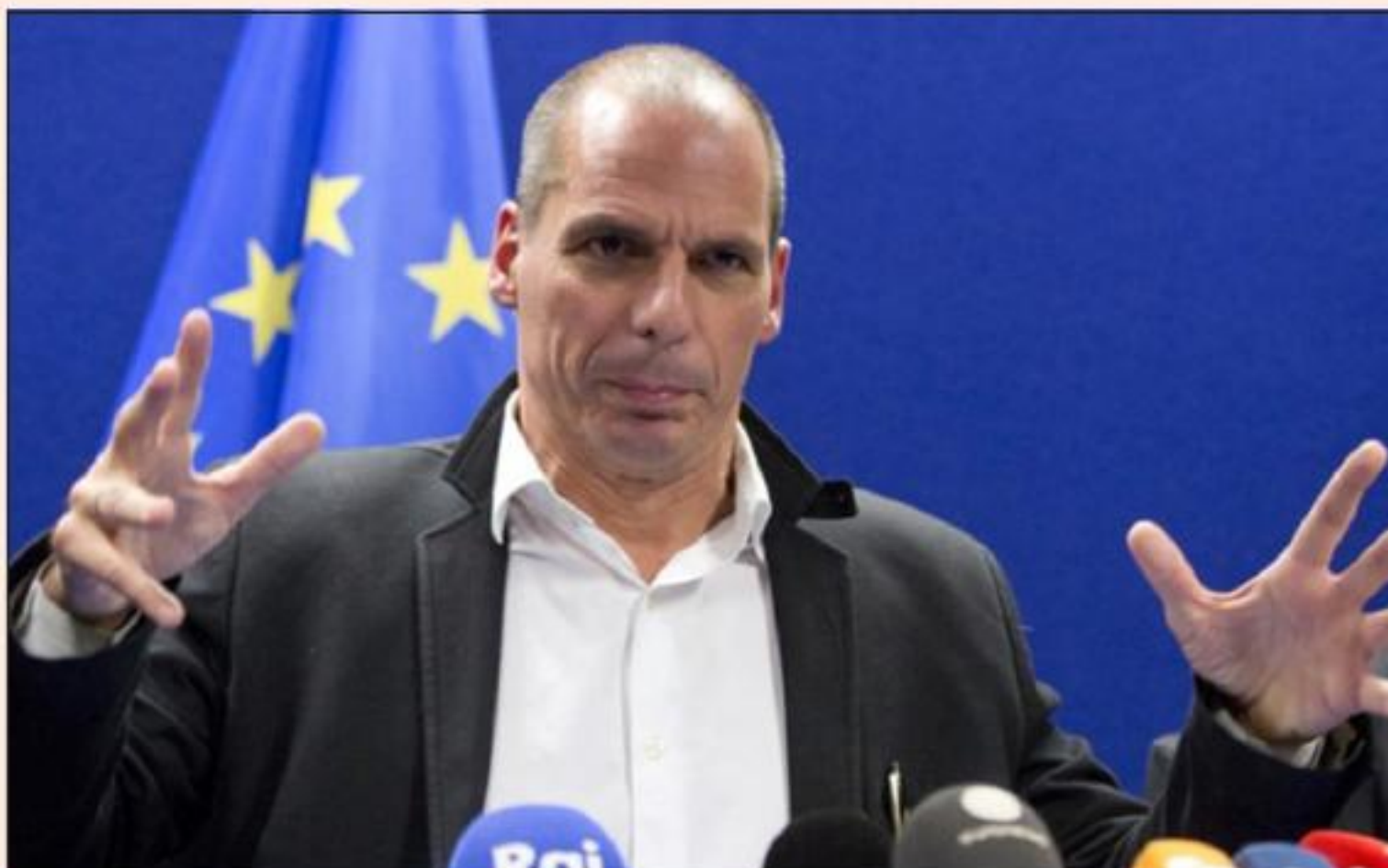
Greek finance minister, Yanis Varoufakis, after emergency meeting with European Union finance ministers in Brussels. Ministers agreed deal to extend the Greek bailout for four months.

This is also why the Irish minion, Michael Noonan, quietly cheered on Schäuble as he stuck the boot into Greece.