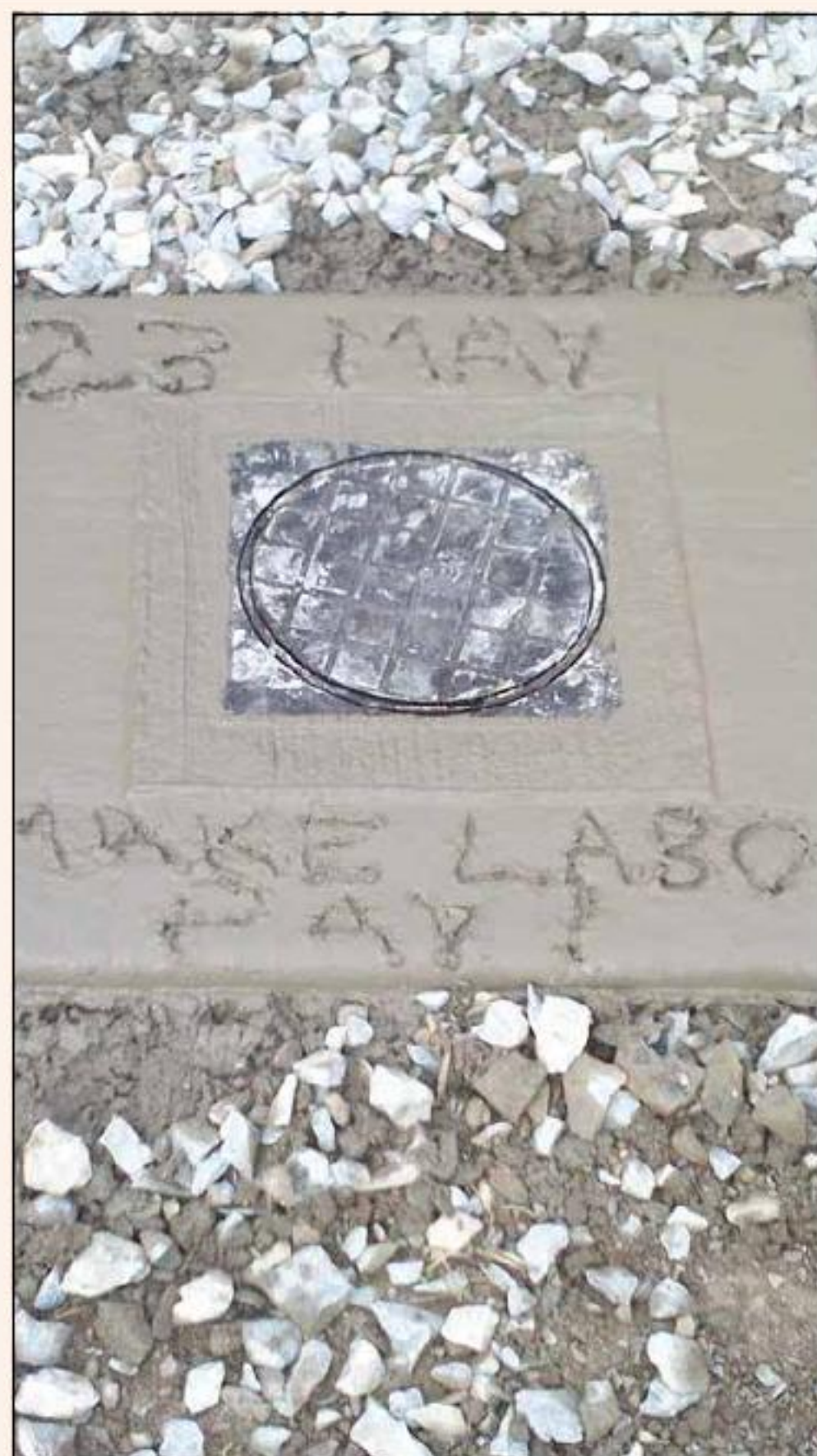
A bit of creative writing on wet cement around the Meter casing this morning. No meter inside! I refused to allow it! The workers were grand lads and stood back while I wrote it and said they thought I was dead right!! :-) Deirdre