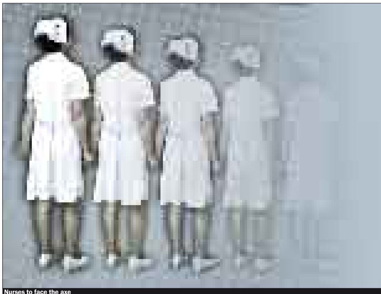
Nurses to face the axe

The recession is already affecting people, these cutbacks and job losses will make peoples' lives