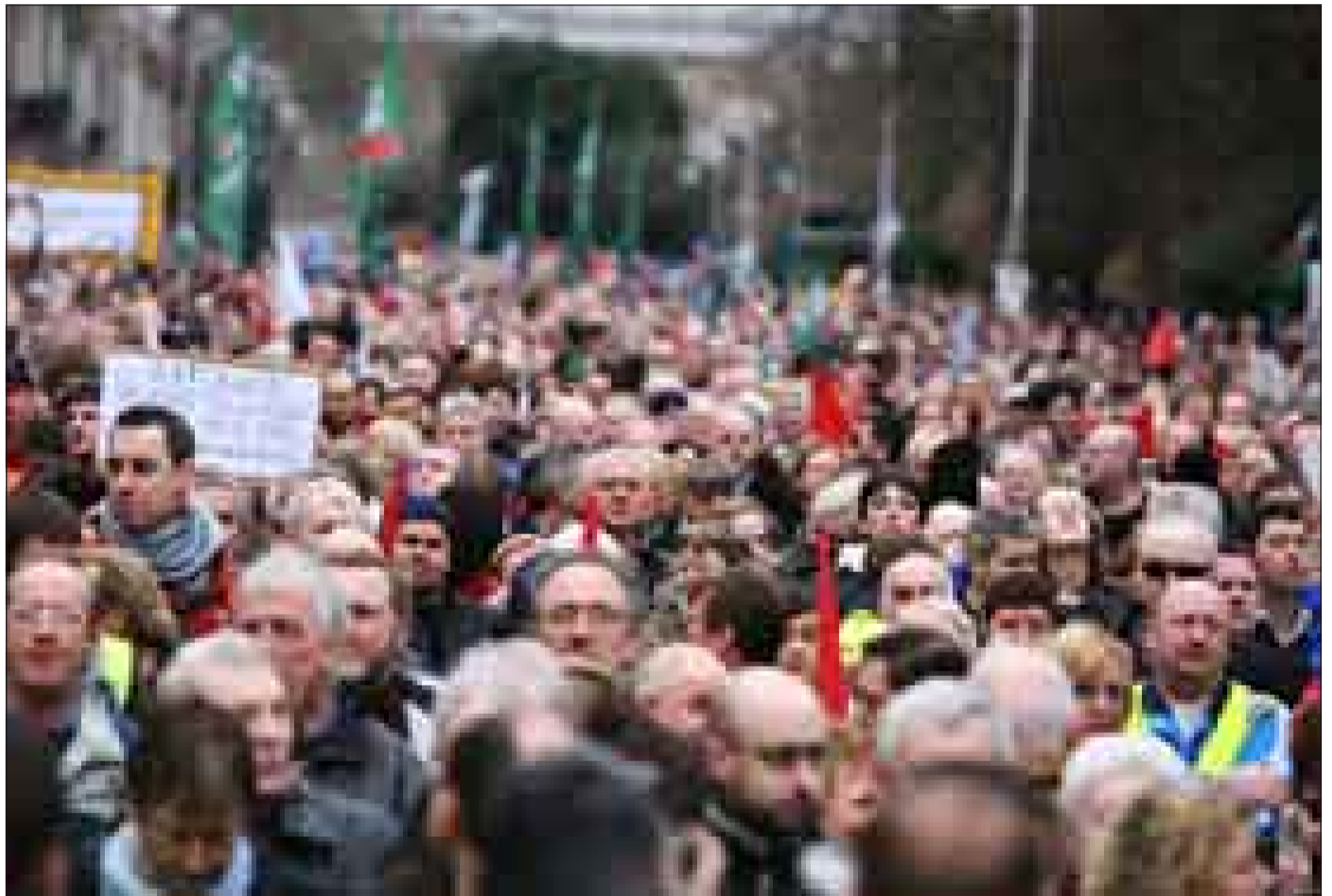
The huge ICTU march in Dublin in February should be followed up with a one day national shutdown

■ They left 13,000 CPSU members strike alone. SIPTU and IMPACT even sent out letters to members to tell them – wrongly - that solidarity action was illegal.