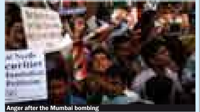
Anger after the Mumbai bombing