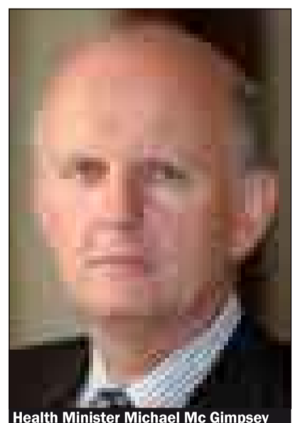
Health Minister Michael Mc Gimpsey

It was all the main parties in Stormont who actually agreed to the cutbacks in the assembly budget.