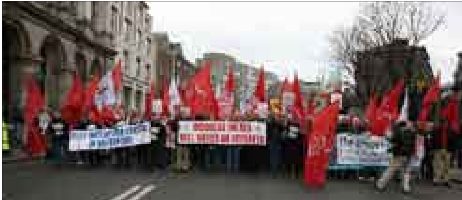
Waterford Crystal workers lead the 120,000-strong ICTU march in Dublin on February 21.