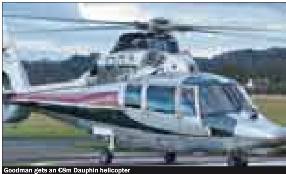
Goodman gets an €8m Dauphin helicopter

Fifty metres in length and containing six luxury cabins, the Lady Ann Magee is capable of accommodating 12 guests. It has a Jacuzzi, a swimming pool and an en-suite sauna and requires 12-crew to operate.