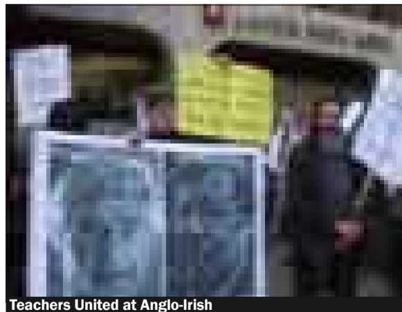
Teachers United at Anglo-Irish

TEACHERS UNITED, an alliance of trade union activists from across the three teacher unions, INTO, ASTI and TUI held a second protest outside the Anglo Irish Bank on Stephen's Green on Monday 23rd February. Around 30 teachers gathered to protest at the imposition of the pensions levy while bailing out banks with billions of euro. Many activists from Teachers United are also active in the National Public Service Alliance, which is calling for a complete reversal of the pensions levy, a national stoppage as a first step in