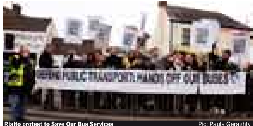
Rialto protest to Save Our Bus Services.