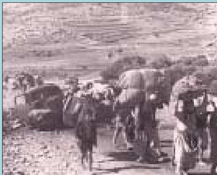
Palestinians fleeing the massacre at Deir Yassin in 1948