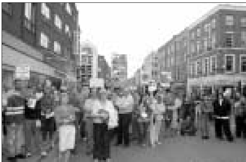
Protesting Israeli assaults on Lebanon in Limerick

■ End Irish government co-operation with Israeli military.