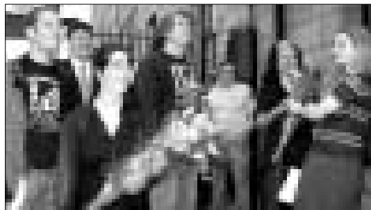
Courage rewarded: Pitstop Ploughshares Not Guilty

The legal process has its biases, not least in the power of the judges, who are drawn overwhelmingly from the most privileged social class. Nevertheless, in Ireland and the UK it has one great strength: the jury system. The right to be tried before twelve randomly selected people means that wealth and power does not always prevail in the courtroom.