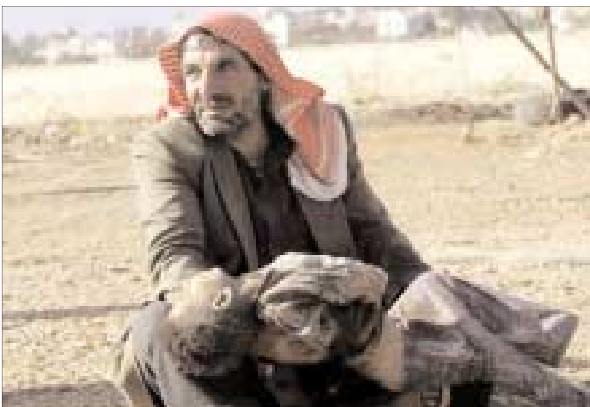
A Lebanese man holds the body of a child killed by air strikes in Baalbek.

Called by Irish Anti War Movement, PANA, NGO Peace Alliance