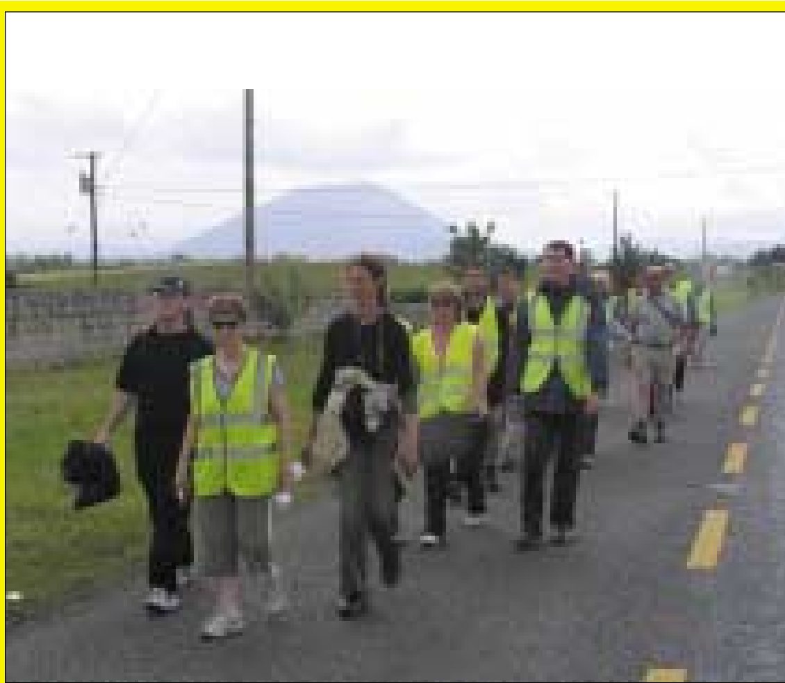
Members of the Shell To Sea Campaign from Mayo take the long walk from Bellinaboy to Dublin. They will arrive in Dublin around midday on Saturday 12th August where they will be joined and welcomed by hundreds of supporters.

In the case of our natural resources the government is dictated to by the oil companies. Dá bhri