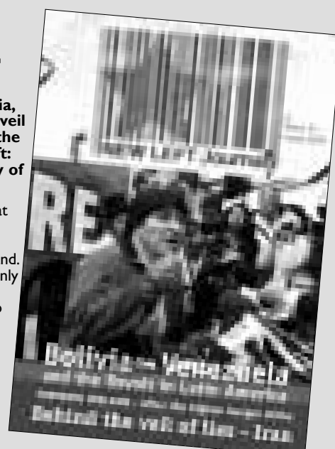
New Left Journal is available at €3 plus postage from Bookmarx, PO Box 1648, Dublin 8

In this way, we hope that New Left Journal may become a genuine forum of the anti-war movement, of anti-racism and the battles against the neoliberal agenda in Ireland.