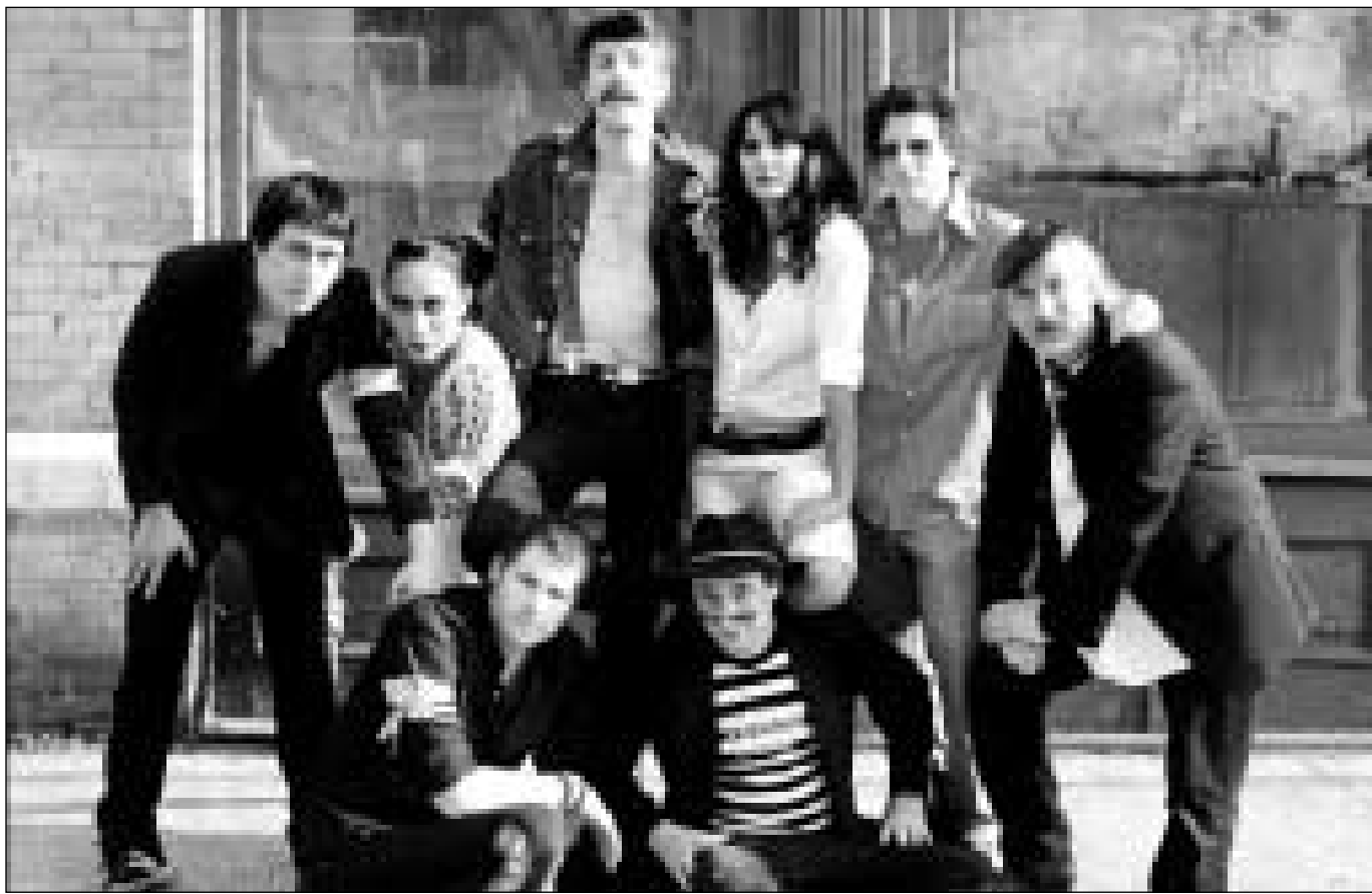
Gogol Bordello: "The Clash having a fight with The Pogues in Eastern Europe"