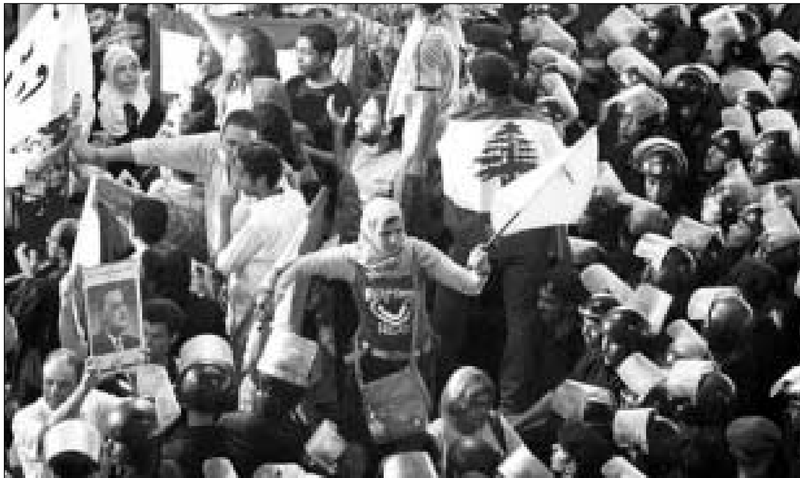
Thousands of protesters took over Talat Harb Square in central Cairo, Egypt, last week to demonstrate against Israel's assault on Lebanon and the failure of the Arab regimes to oppose it.

'Hizbollah is for all Lebanese. They are the resistance force for the occupation'