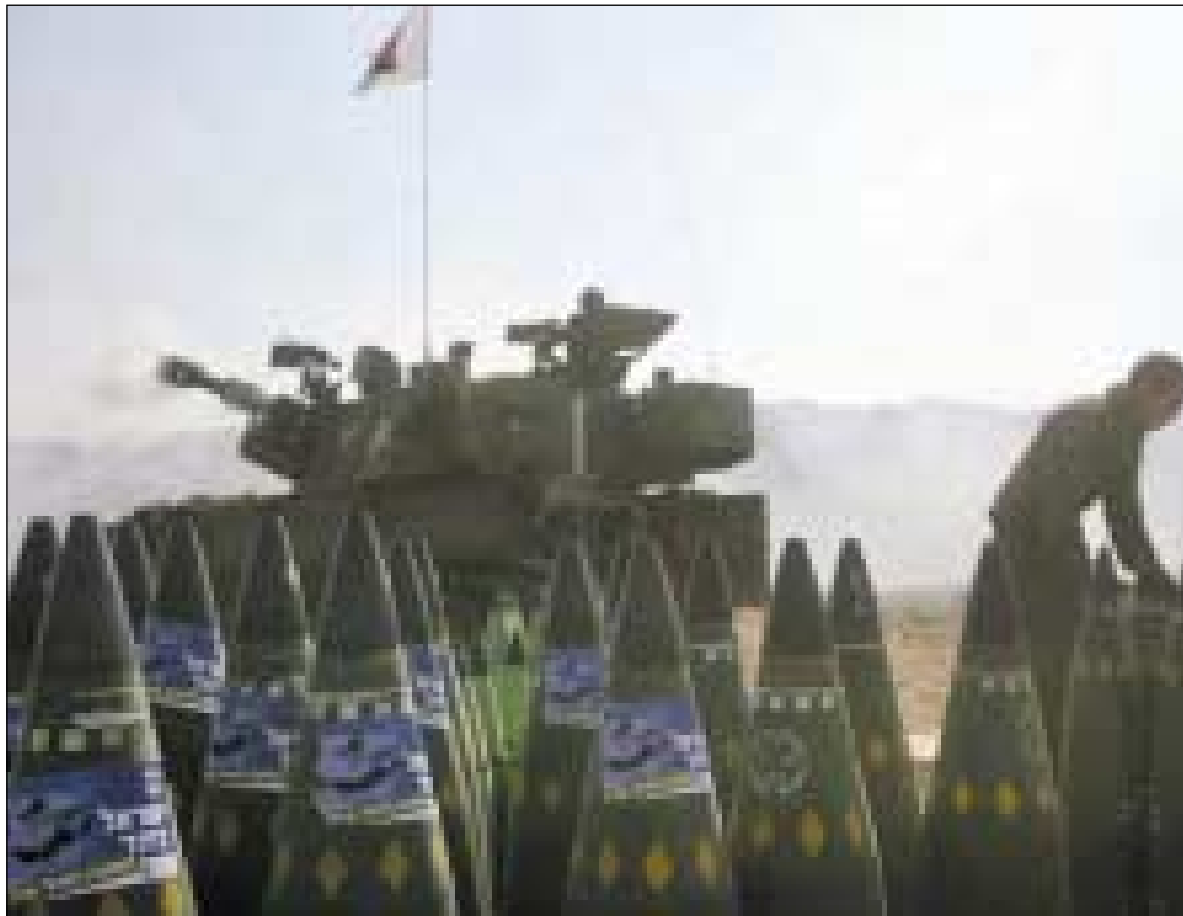
Murderous attacks: Israeli artillery units fire shells towards Lebanon constantly.

Acting alone Israel could not achieve these aims. However, its war coincides with the Bush administra-