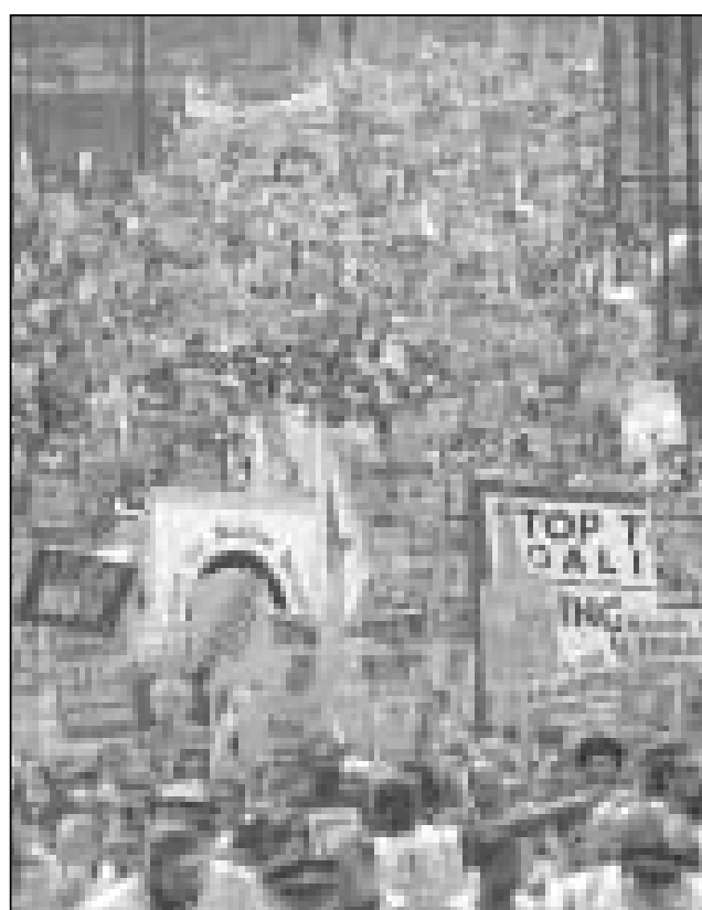
Part of the London demonstration

"Only the peace movement can destroy the power behind these wars. That's why we must demonstrate in Manchester on 23 September outside the Labour Party conference - and demand an end to this government steeped in blood."