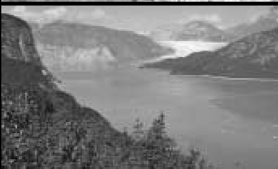
Top: Alaska's Glacier Bay National Park in 1941 shows the glacier 2,000 feet thick, Above: By 2004 shows changes to Riggs Glacier in Muir Inlet and the growth of vegetation where there was none in 1941.

sector in planning, transport and energy production.