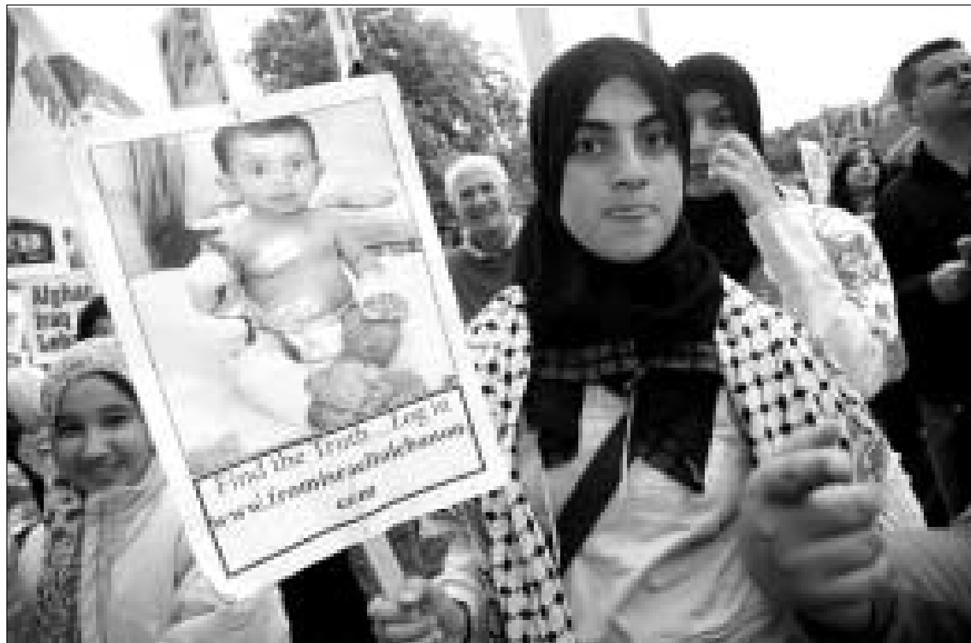
Up to 3,000 people demonstrated in Dublin on 29 July against the assault on Lebanon