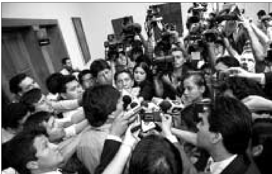
The media scrum around Morales following his election victory

The question raised in all major struggles of 'who rules?' was strongly