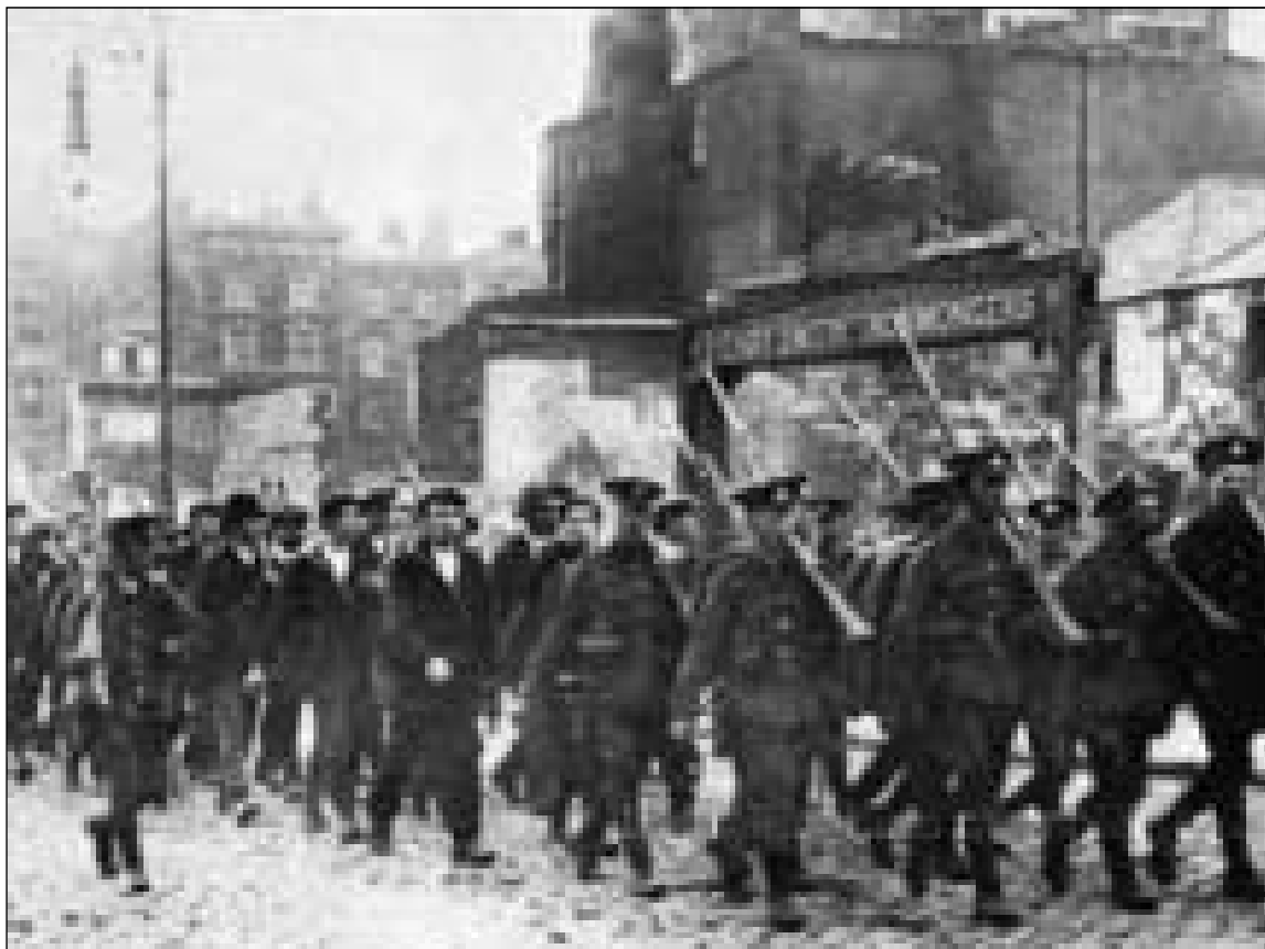
Prisoners marched away by British soldiers in Dublin after the 1916 rising

Other films to look out for include Stephen Spielberg's controversial wading into the Israeli- Palestinian