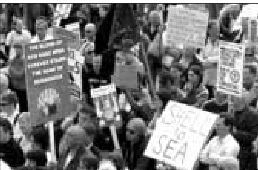
A previous demonstration in Galway for Shell to Sea

He has not conducted many formal meetings with key campaigners. His report was supposed to be on Minister Dempsey's desk in mid