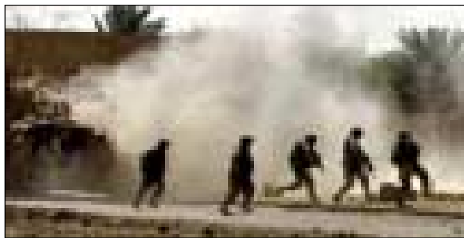
End the Occupation

It declares that the occupation of Iraq by US and British military forces has brought misery and suffering to the people of Iraq. The occupation represents the denial of their national rights, impedes social, economic and political development and threatens the wider peace in the