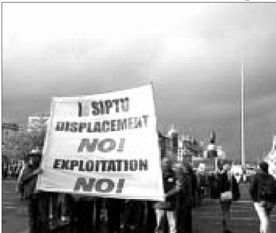
Above and previous page: Huge demonstrations in support of Irish Ferries workers in December

Second, the share of the economy going to wages and social welfare has declined faster in Ireland than elsewhere in the older EU states. Their share of the total economy in the EU fell from 72 percent in 1987 to 68.3 percent in 2000. In Ireland, however, they fell from 71 percent to 58 percent.