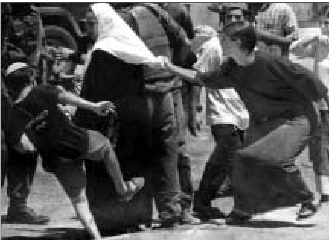
Israeli "settlers" attack Palestinian woman

activists is the subject of some debate - some observers suggest that it will deprive Hamas of influential local figures who could help them swing extra votes. Others suggest that Israel's policy is likely to benefit Hamas in the West Bank as it will add to the percep-