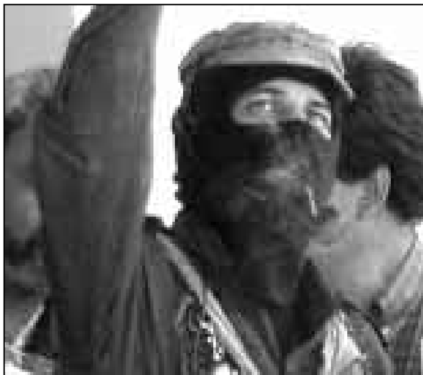
■ Zapatista leader Subcomandante Marcos and (top) San Cristobal 1994

faces the question of the power of big business and the state machinery that promotes its interests, the Zapatistas are confronted with the power of the Mexican state that has been attacking it on all sides.