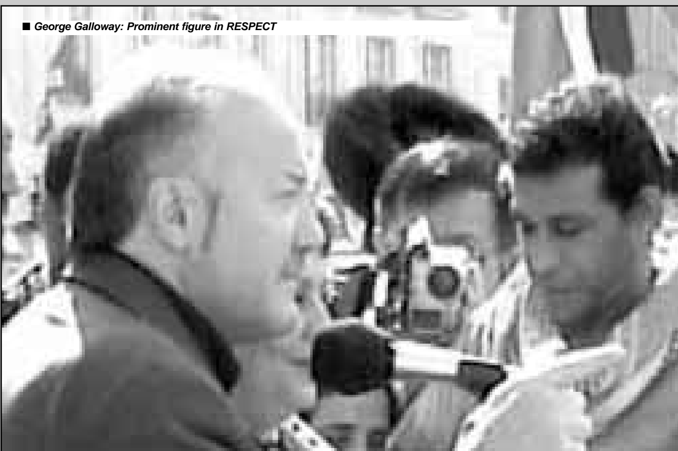
■ George Galloway: Prominent figure in RESPECT