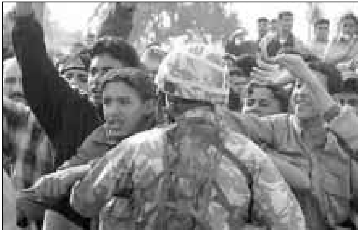
■ Iraq: Resistance grows. US soldiers face demonstrators in January.

According to the New York Times a senior official said that dozens of linguist and intelligence analysts who were assigned to the team have now been transferred to anti-insurgency duties to combat the growing Iraqi resistance.