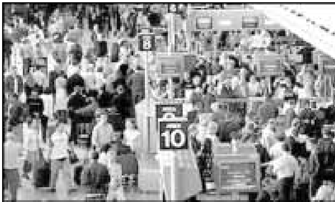
■ Dublin Airport: Stop the break-up

The proposed new EU constitution prepares the way for privatisation of health and education services as part of the Common Commercial Policy. To add to this the Constitution extends the powers given to the European Commission by Article 133 from the Nice Treaty in relation to the promo-