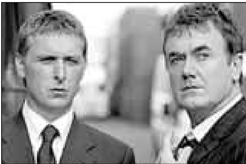
■ RTE's new drama series Proof looks promising

Dublin port is searched and 23 corpses and one survivor are found inside. The fact that the Director of Proof has attempted to render onto film such an incident deserves praise. Refugees and Asylum Seekers have been almost ignored in modern Irish drama and art