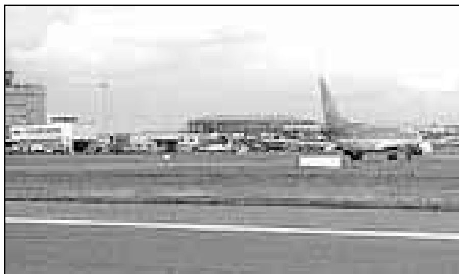
■ Aer Rianta workers are fighting airport break up

A similar threat to call action by CIE workers during the first EU Minister meeting in Galway sent the wind up the gov-