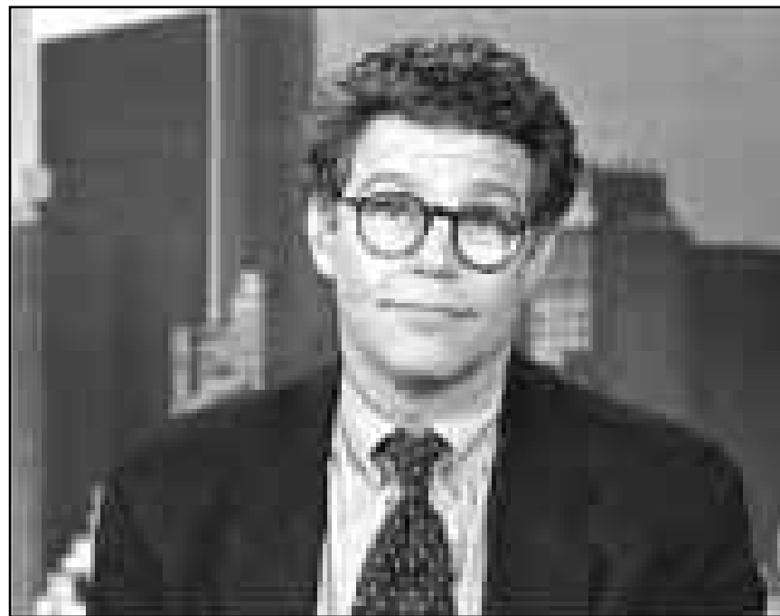
■ Al Franken: Exposes the Right in the US media

But Franken's book is considerably weakened by his politics. For him Republicans are bad guys and Democrats,