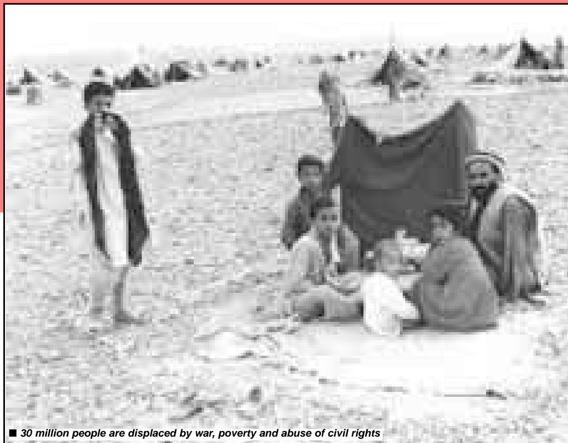
30 million people are displaced by war, poverty and abuse of civil rights

With an EU population of 380 million, it is an inconsequential level of entry yet it is presented as a problem of mammoth proportions.