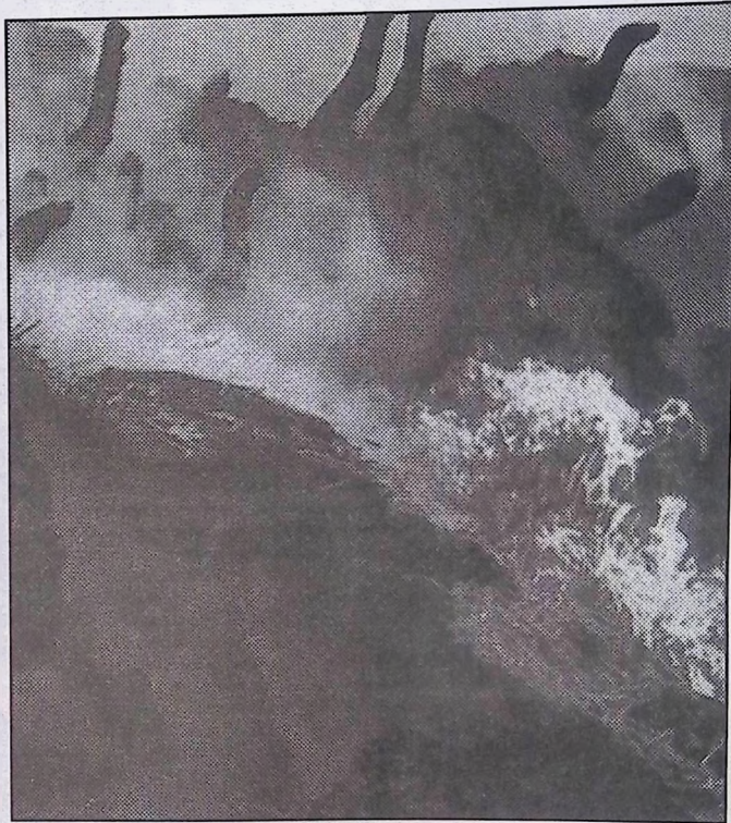
Burning cattle in England

"Foot and mouth is a caused by putting free trade above safe trade. The problem is the people who make all the money from the free trade don't ending up paying. It is the small farmer and the con-