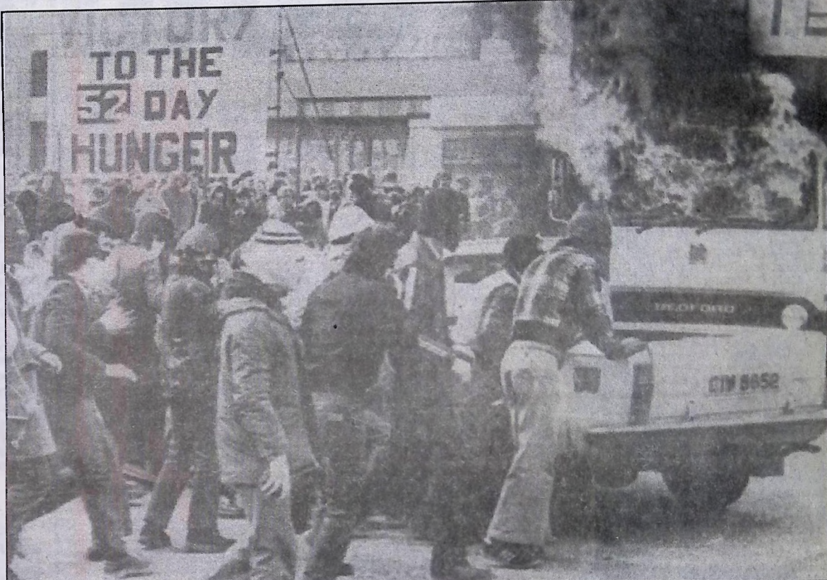
Protests across Ireland