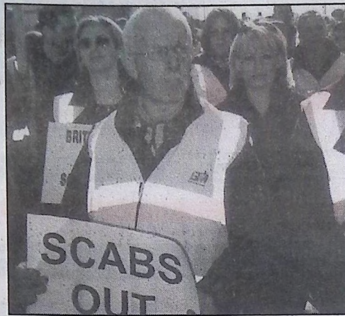
600 airport workers joined the pickets

Darren Allen added: "We still need to sort out the