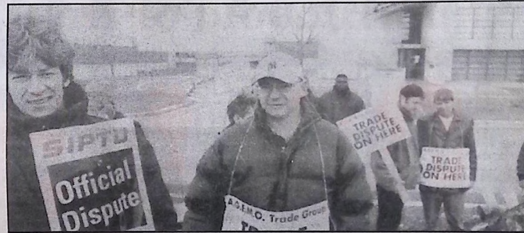
On the picket at NCT

One striker told Socialist Worker , "The Labour Court was very biased towards the employers. The central issues of rostering and health and safety were not properly addressed.