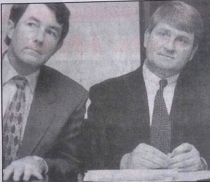
Lowry and O'Brien launching Esat