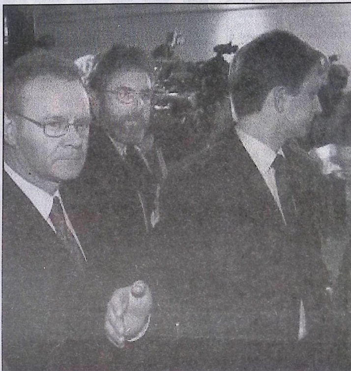
SF leaders now look to big business

At Wellington College in South Belfast, Northwin are building a new school in one corner of the grounds. The extensive