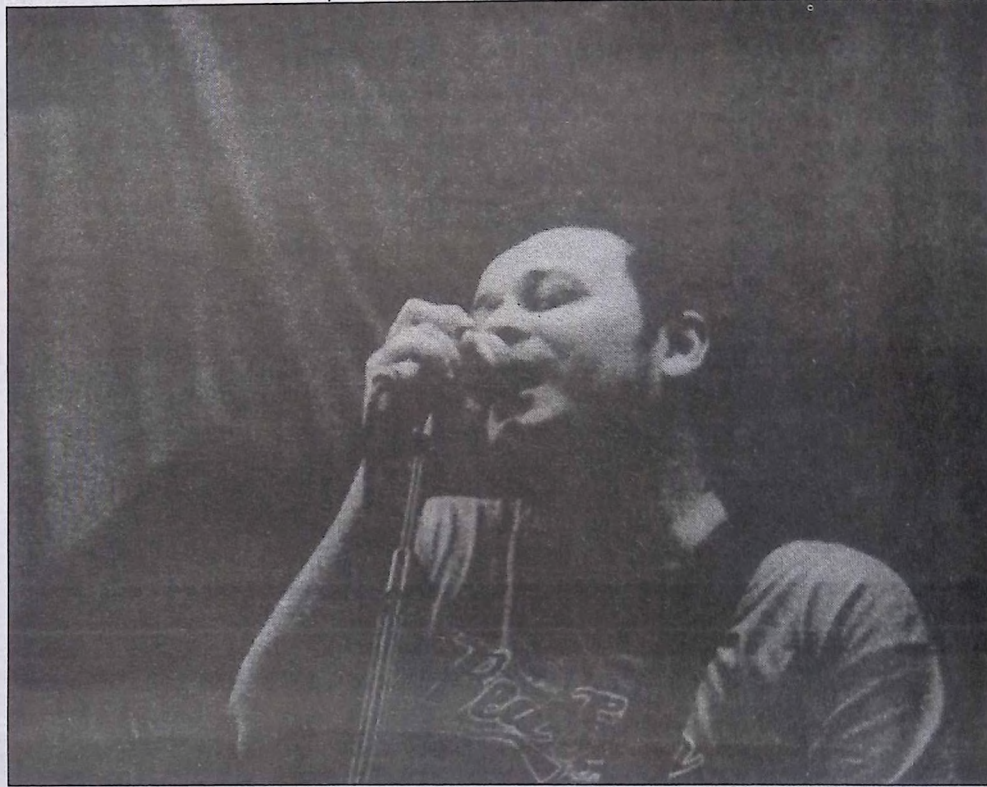
A RED STAR burning — James Dean Bradfield of the Manic Street Preachers

Midlands-Lloyds' from the first album — 'Generation Terrorists' expressed their views on the ruthless banking industry. "They give then take away, repossess and crucify." (Irish borrowers take note).