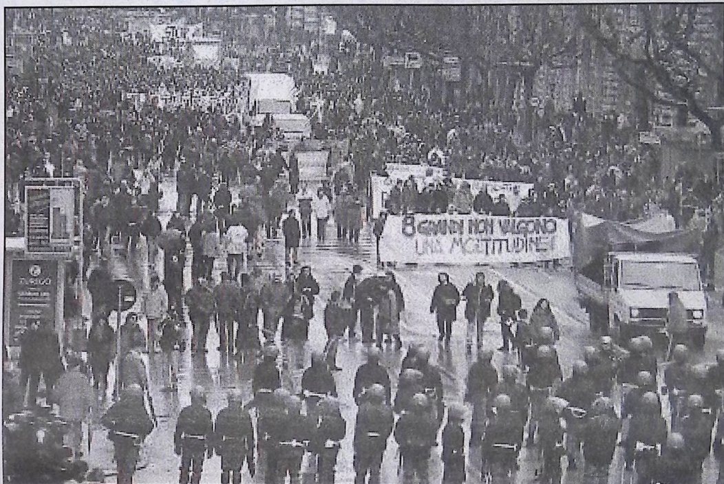
THOUSANDS OF protesters took to the streets of Italy to demonstrate against free market policies outside a meeting of environment ministers from the G8 industrialised nations. Some 3,000 riot police with teargas guns moved into the city of Trieste in order to stop them. The protesters chanted at the police, "You should be ashamed! What are you scared of? Are you scared of defending your planet?" The Trieste meeting was the first time environment ministers have met since the Hague summit last November. The Hague meeting failed to make progress on implementing the Kyoto agreement to cut pollution in order to tackle global warming.