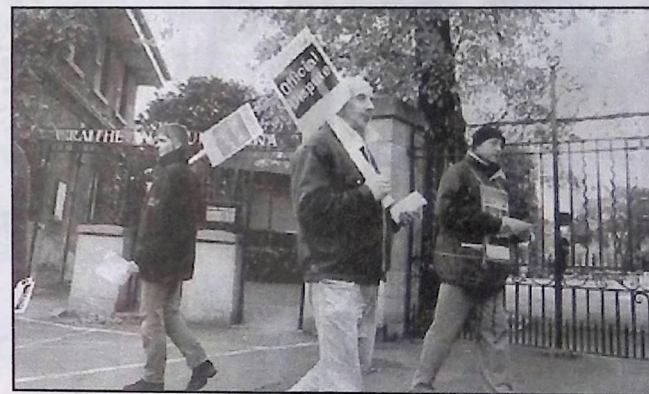
STRIKERS at the Botanic Gardens

In fact one of the gardeners recently went to South America, at his own expense to collect samples of rare orchids for the garden. As a result the