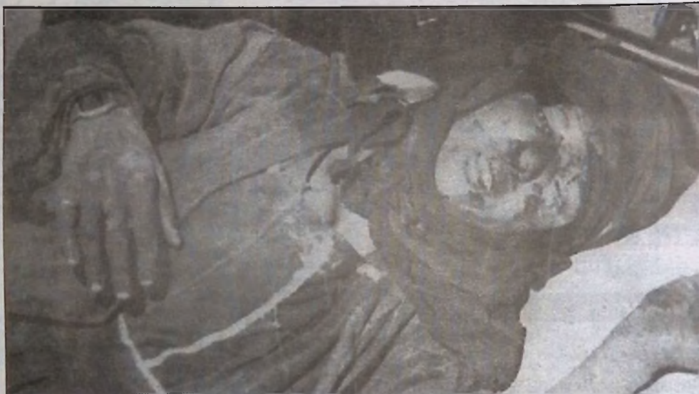
A VICTIM of America's bombing of Iraq in the Gulf war

If Sudan had no chemical weapons, the US and its allies have thousands of tons