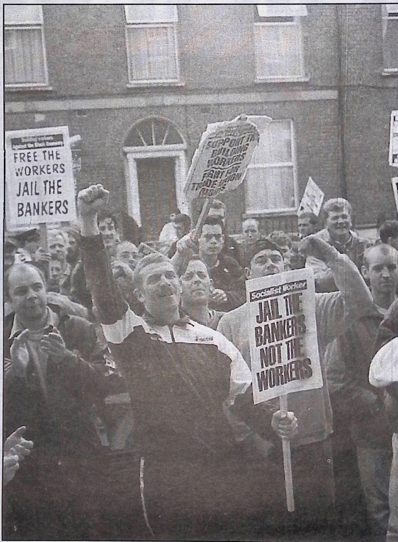
BUILDING workers celebrate the victory of the rank and file over the courts

The network was active during the building strikes and has now produced its first bulletin. Write to the network at 105 O'Hogan Rd, Ballyfermot, Dublin 10, for more details.