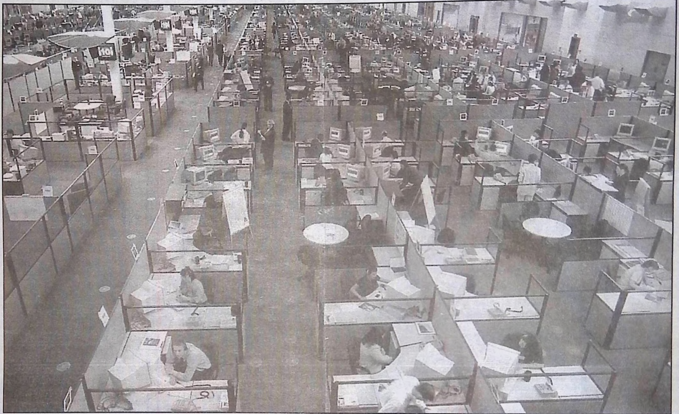
PLANNING and exploitation in a modern capitalist office

In Japan, the government is to nationalise one of the country's biggest banks because they fear that if it collapses the whole Japanese banking system will go down the tube. Yet at the same time the Irish government claims it can't nationalise companies like Fruit of the Loom, when they are threatened