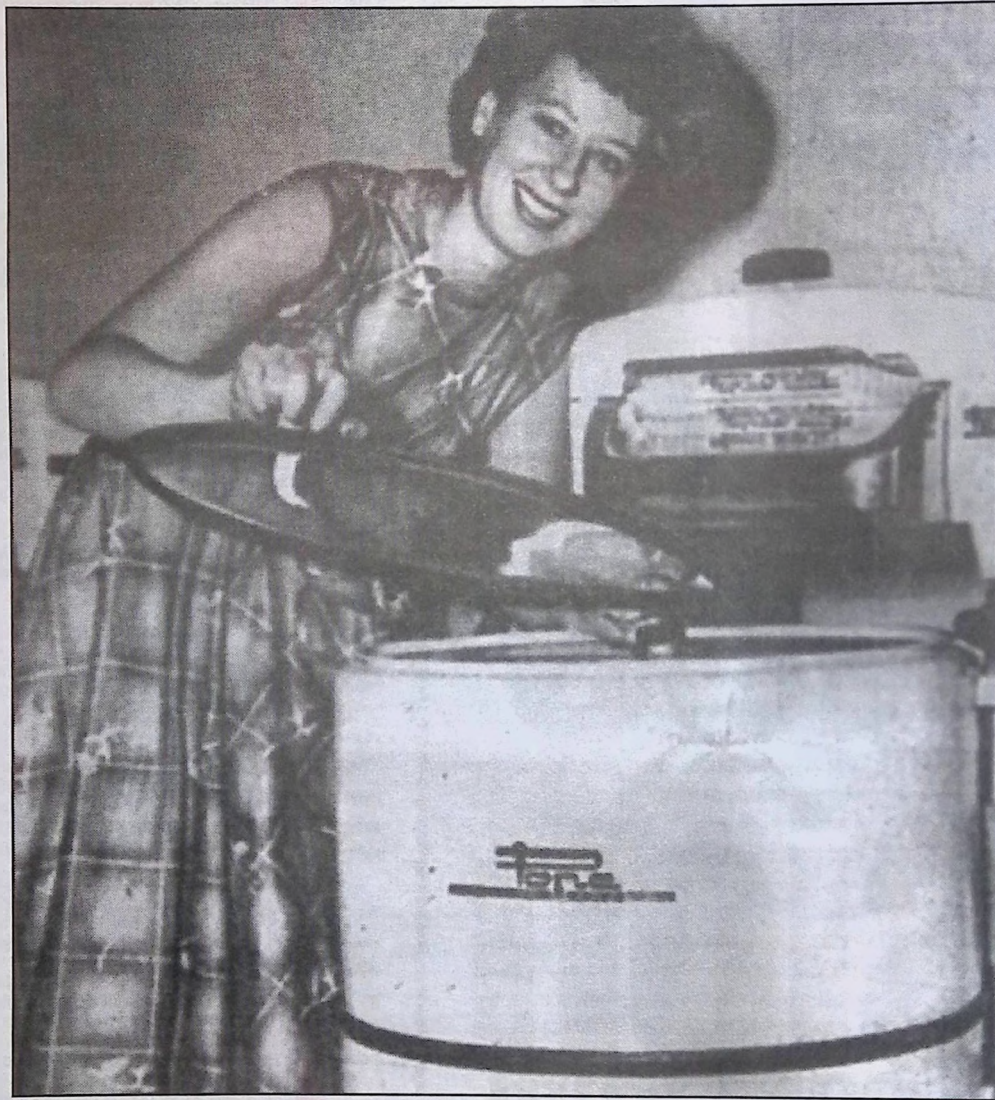
■ Does our biology mean that a woman's natural place is in the home?

As Steven Rose writes, Pinker and others like him argue that our genes and human nature "evolved to suit humanity's Stone Age existence". Un-