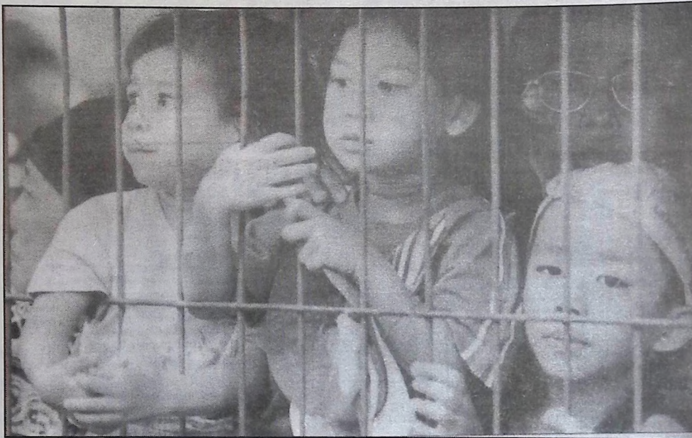
CHILDREN QUEUE for food as poor suffer in economic turmoil

The row is over whether Suharto and the local capitalist interests he represents will bow before the even bigger interests represented by the IMF.