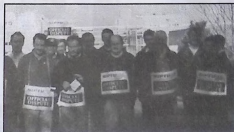
Workers on the Picket line at Roche Ireland

Local dockers provided food to the mutineers—who include Egyptians, Ukrainians, Indonesians and Greeks—a gesture which contrasts with the racism of politicians towards immigrants.