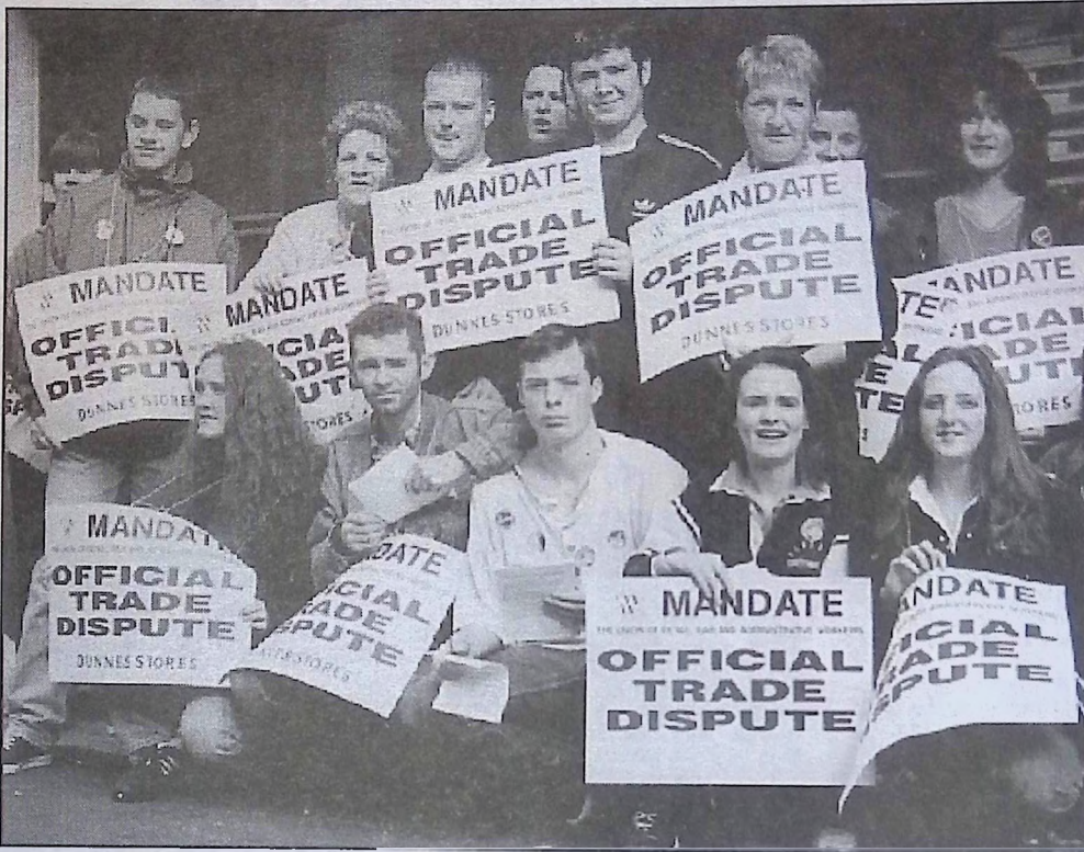
UNIONS RECRUIT when they are willing to fight

"We have been given no deadline for when this inquiry is supposed to end.