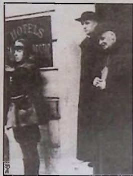
The Bishop of Paris leaves Vichy headquarters

sheltered in convents and churches and many priests actively risked their lives.