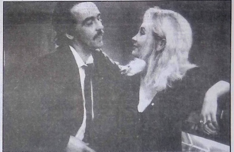
The DUP hate it, but the film falls short of explaining the killings

The fictional Kelly is presented as a demonic figure, influenced as a child by too many American