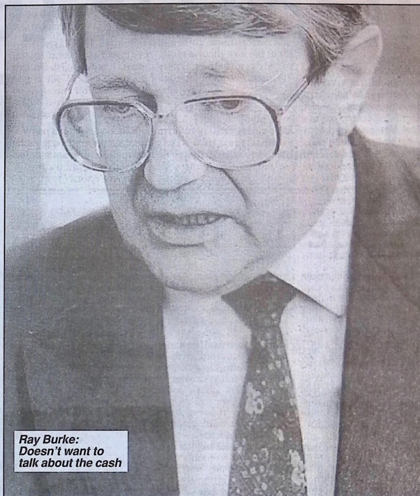
Ray Burke: Doesn't want to talk about the cash