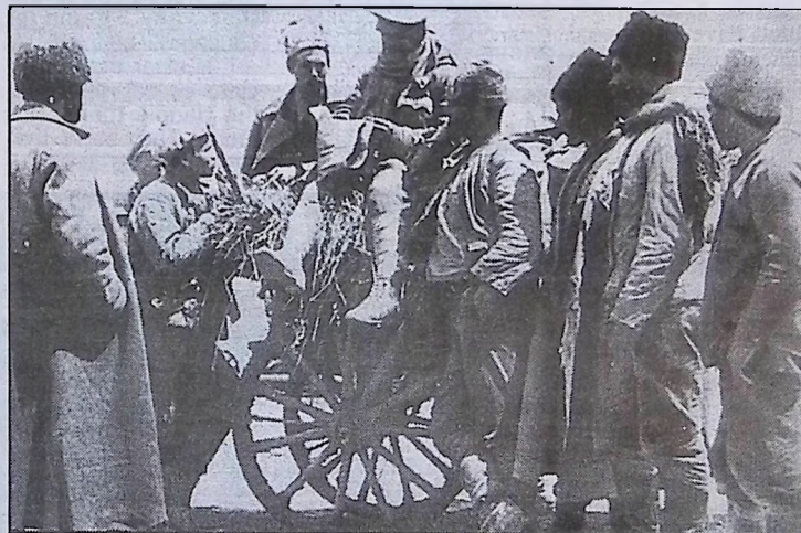
Fighting for the revolution: A group of Red Army soldiers on the South Eastern Front reading a news bulletin in 1919. Victor Serge brings the struggle to life

Winston Churchill explained their motives when he said that, "civilisation is being completely extin-