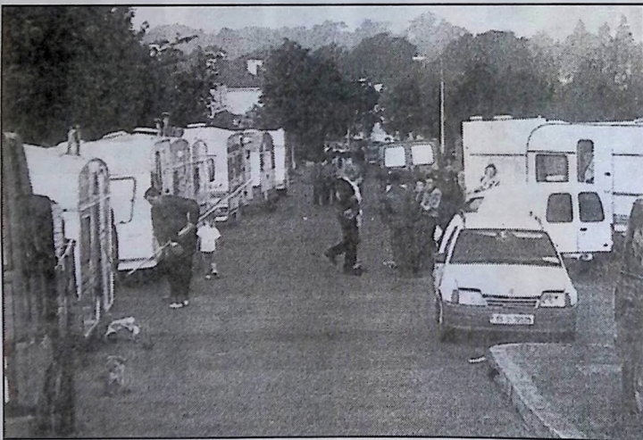
■ Travellers forced to camp at the side of the road

TRAVELLERS continue to be the butt of racism as government and local councils refuse to provide adequate resources.