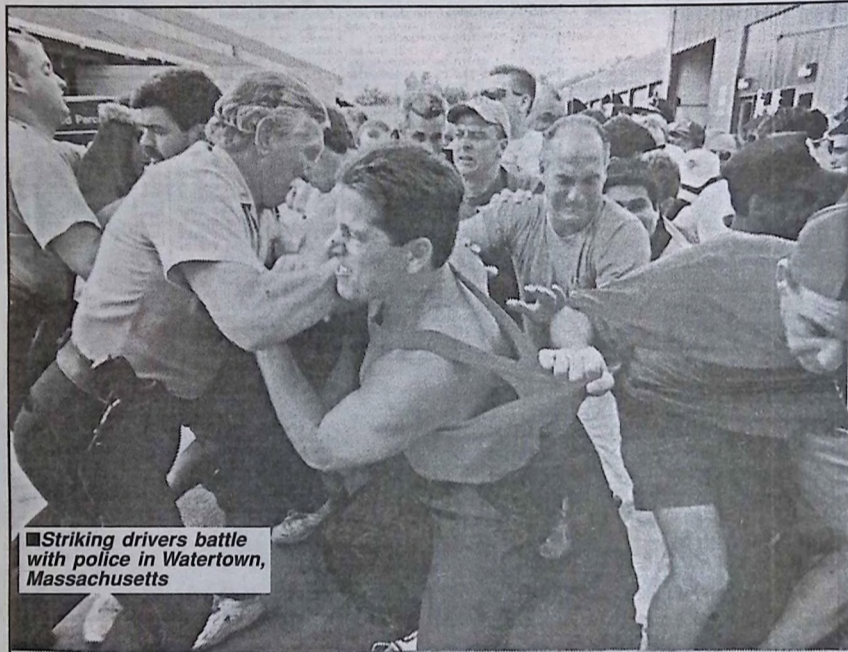
Striking drivers battle with police in Watertown, Massachusetts

The company has been in the forefront of a 25 year employers' offensive that has driven down wages by more