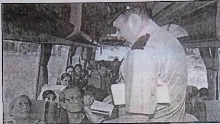
■ Gardai checkpoint in Co Louth

In fact the estimated number of asylum seekers is only 2,254—less than one for every 1,500 of the Irish population.