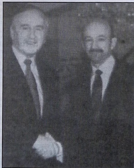
Albert Reynolds with Salinas

But this bloodsucker is being sheltered by the