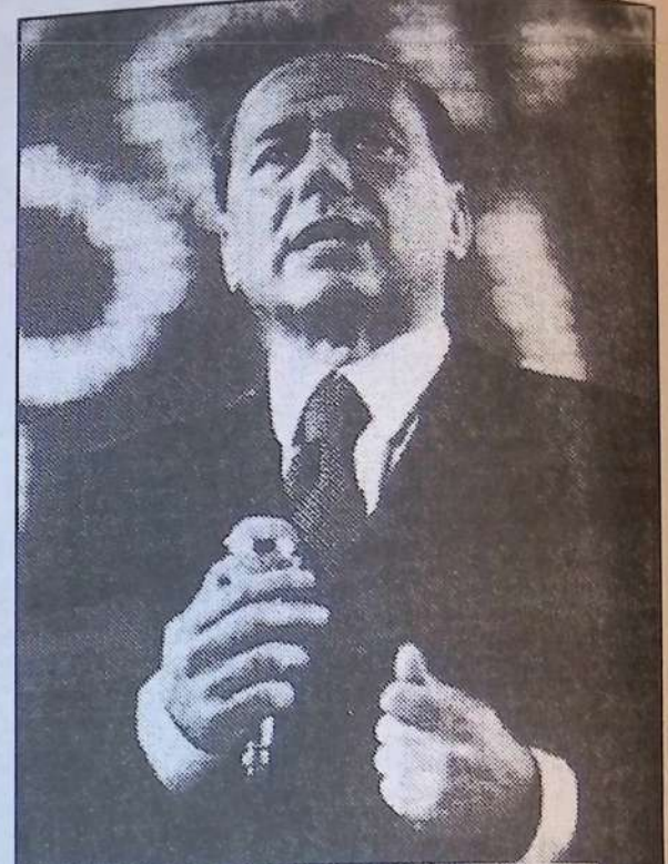
Berlusconi: Heads right-wing alliance

The fascists' election success is a terrible warning—but there is time to stop them.