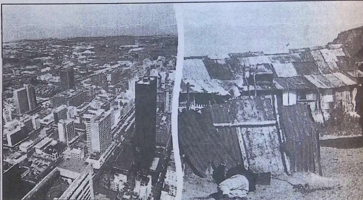
Wealth in Johannesburg contrasts with the squalor of a Cape Town settlement

THE elections will bury the legal apparatus of apartheid but voting alone can do little to dismantle apartheid's dire legacy.