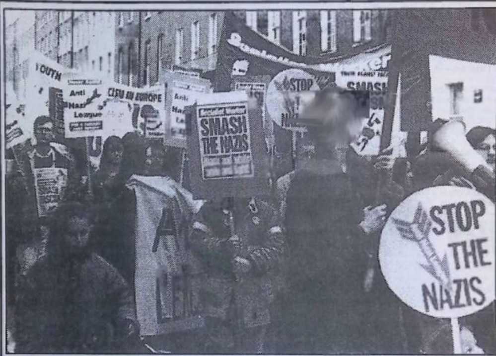
One thousand people took to the streets of Dublin in March to show their solidarity with those fighting fascism in Europe. The march was organised by the Irish Anti-Nazi League.

But Major is a hypocrite. He pretends to talk peace but he is more interested in keeping his tottering government together.