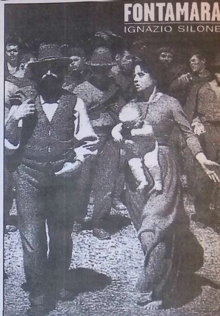
FONTAMARA IGNAZIO SILONE

A bare outline of the plot of the book cannot begin to give a flavour of its passion, its bitter humour, in great artistry.