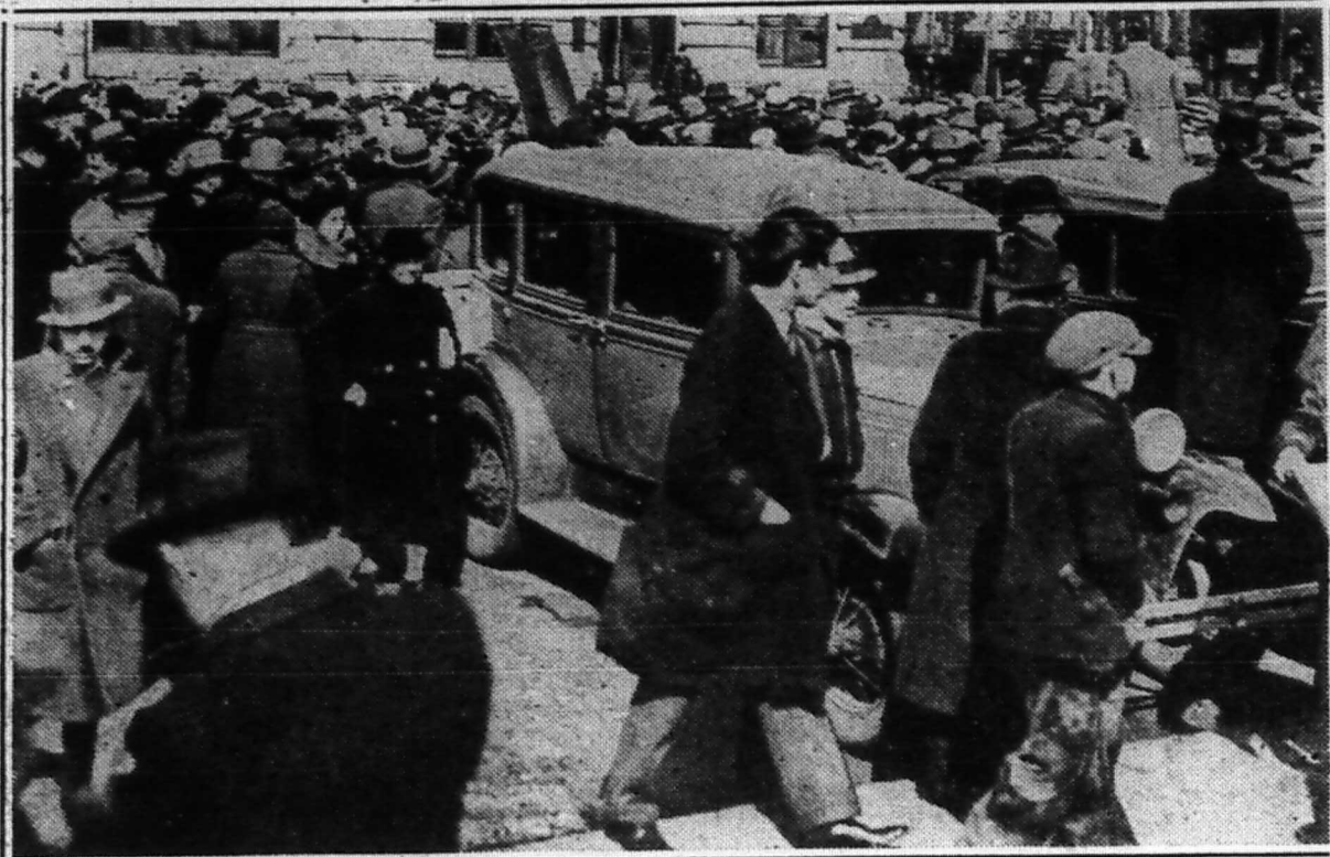
Scene showing the milling crowds following a police foray on a band of Cuban strikers. At the peak of this revolutionary strike against the rule of Carlos Mendieta, who is backed by Wall Street bankers, 300,000 students and teachers had joined in the walk-

out. The break-up of the strike has been accomplished with ruthless use of military and police force; hundreds of revolutionaries killed and wounded, while their leaders are shot without trial.