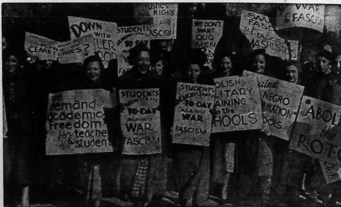
This picture is taken from an incident in an Armistice Day Anti-War parade last year by women students at Dana College as they marched through Military Park in Newark, N. J. On scores of campuses across the nation, scenes like these will be re-enacted as college and high school youth pour forth