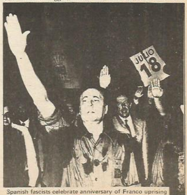
Spanish fascists celebrate anniversary of Franco uprising

This prudence saved their skins. After the war both regimes gradually made their peace with the 'democratic' powers of Western capitalism, despite the idle hopes of opposition forces that the victorious allies would reject these offspring of defeated fascism. Portugal was admitted to NATO in 1949. Spain, symbol of anti-fascist struggle, whose ties with the Axis had been