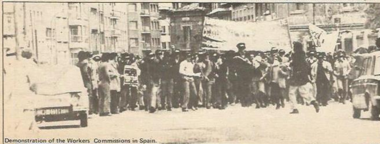
Demonstration of the Workers Commissions in Spain.

Further strikes took place in the northern city of