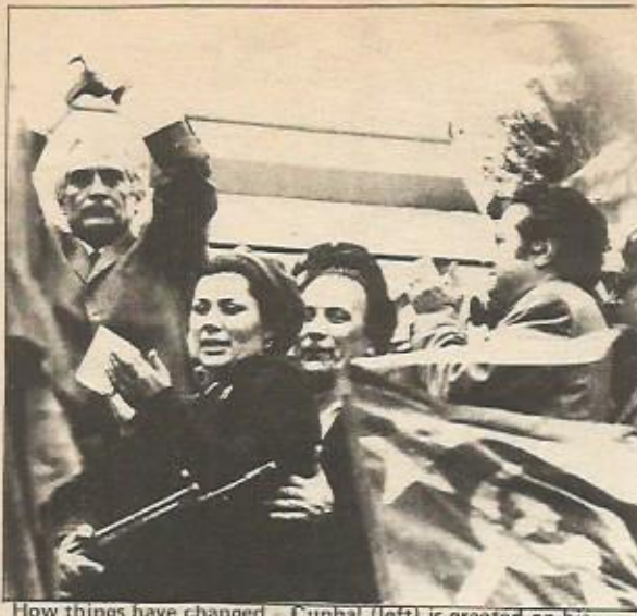
How things have changed - Cunhal (left) is greeted on his return from exile by Soares (right)

a drive for a united front with the Socialist Party, not in order to allow it to carry out its pro-capitalist programme, but in order to expose to the Portuguese masses the contradiction between the programme of the Socialist Party leaders and the possibilities that united working class action opened up.