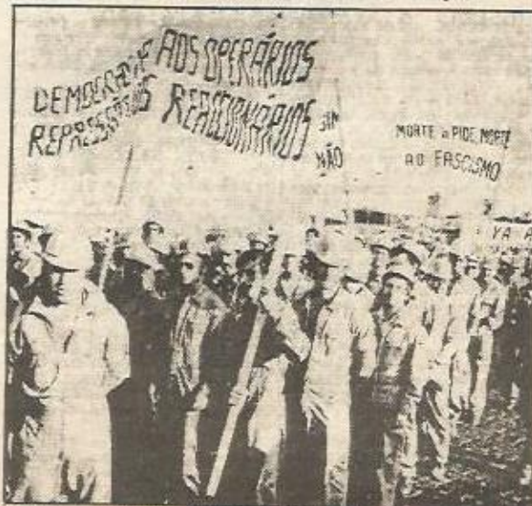
'Democracy for the workers, repression for the reactionaries' — that was the slogan of the Lisnave shipyard workers

The coordination of Popular Assemblies at the regional, and most important of all the national level, would create the sort of set-up that could really begin to tackle the problems of the economy as a whole, replacing capitalist anarchy with socialist planning, democratically determined by the representatives of the working masses and carried into effect by its