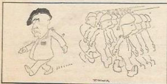
Spinoia went one way, the masses the other

Both of these views, however, fail to explain the actual way in which the AFM has developed since 25 April. If it were either the 'vanguard of the revolution' or the instrument of a 'capitalist bonapartist' plan it should have had a clear-sighted view of where it was going and a relatively consistent strategy for getting there. But the AFM displays none of this.