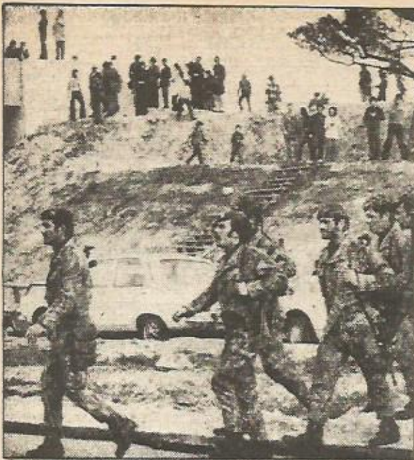
Soldiers misled by their officers on 11 March were soon put right by the popular mobilisations against the attempted coup.

an argument between the owner and a customer over the price of a cup of coffee, the matter ended with the customer being shot in the head by the police, and irate onlookers then running the police off the street and wrecking the cafe.)