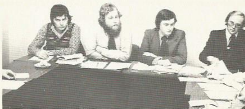
Charles Clarke announces the closure of the companies at a London press conference.