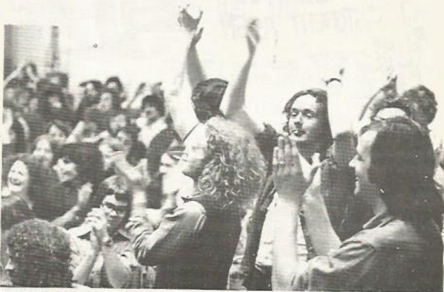
Moray House delegates greet the decision by the Manchester Conference to lobby the TUC.