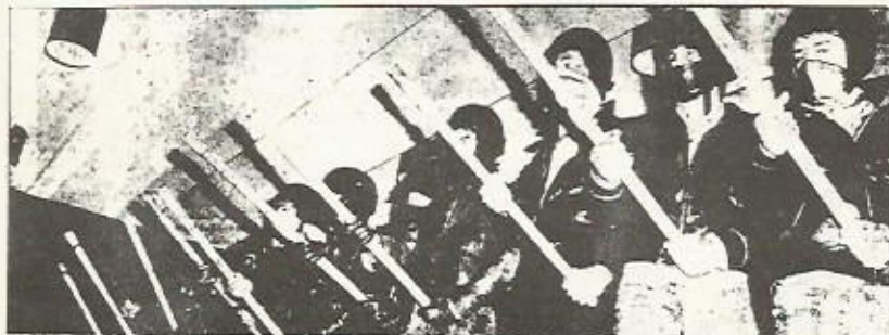
FRANCE 1976 — far right law students prepare for battle against the left.

IN OTHER EUROPEAN COUNTRIES attempts to make education fit the needs of capitalist industry are more advanced. In France, for example, there have been many struggles over the past eight years against 'reforms' of higher education. The biggest obstacle to these struggles has, however, been the the divisions in the student movement.