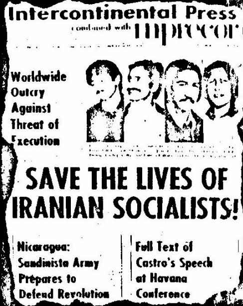
Top: Mr Tariq Ali's 'Socialist Challenge' whips up counter-revolutionary propaganda against Khomeiny (June 28 and August 30, 1979). Bottom: The SWP agents change course. In the SWP's 'Militant' on November 30, it is 'Stop the US war against Iran', but no mention of the trial of the US hostages for espionage.