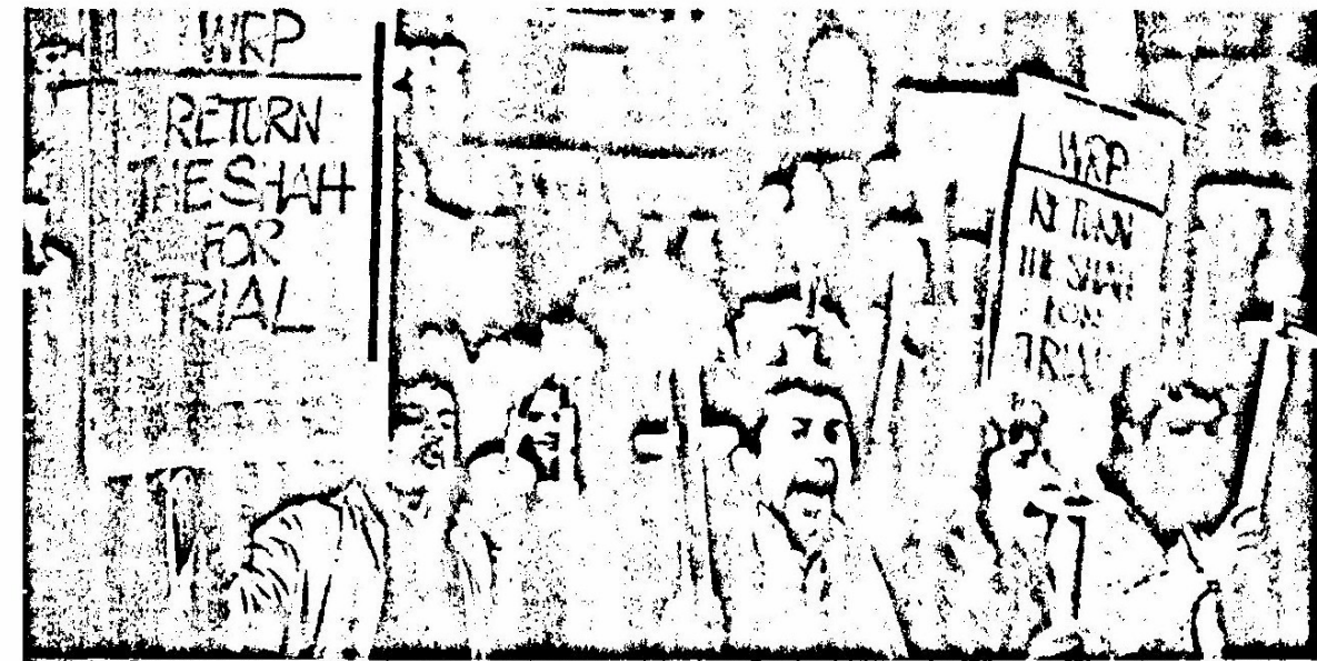
The Workers Revolutionary Party holds a rally and a torchlight demonstration in London on Tuesday night, November 27, in support of the Iranian Revolution and its demand for the extradition of the ex-Shah. The WRP is the only party which has consistently supported the revolution against imperialism, Zionism and