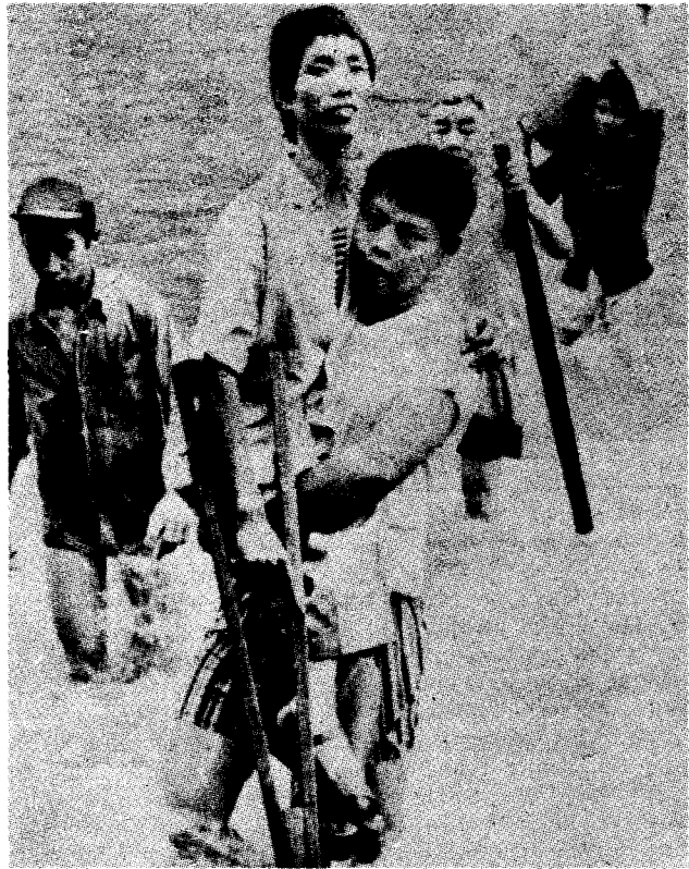
Refugees arriving in China from Vietnam.

But while the vast majority of "overseas Chinese" are of course not capitalists, nevertheless, like the Jews in medieval Europe and to some extent the Lebanese Arabs in Africa, they have historically formed an educated, petty-bourgeois and merchant caste which has dominated