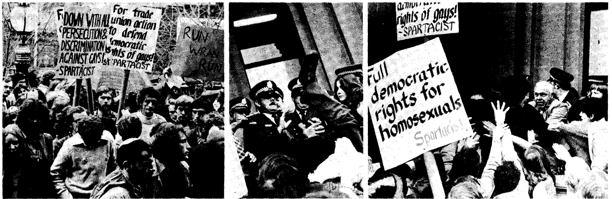
26 June protest at Sydney Central Court hearing for 53 arrested two days earlier; brutal attack by Wran's cops led to 7 more arrests.