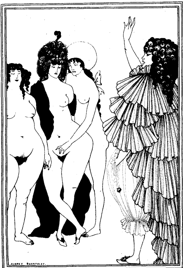
One of the "Lysistrata" illustrations by 19-century artist Aubrey Beardsley banned in Queensland in 1969 as "pornography".

In waging a battle against the manifestations of women's oppressed status without attacking its roots in capitalist class society, feminists of both the Innes and Brownmiller varieties end up in the dangerously reactionary position of denying fundamental bourgeois-democratic rights in practice. In bloc with the most reactionary, anti-women's-rights elements, like the Festival of Light and the recently formed Australian version of the fascist National Front, they have raised the demand for censorship of "pornography". Why? According to Brownmiller, "pornogra-