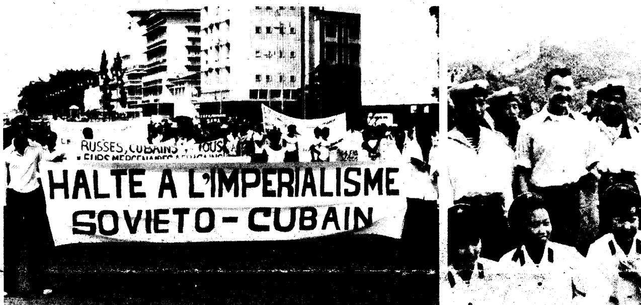
Demonstration against USSR, Cuba in Zairean capital Kinshasa (left); Carter's cold warrior Brzezinski in China.