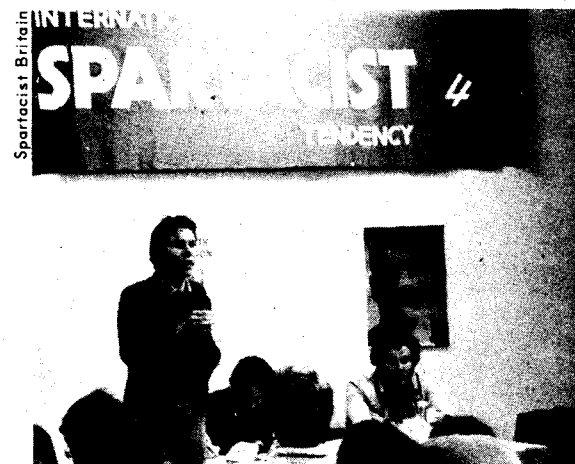
Founding conference of Spartacist League/Britain.