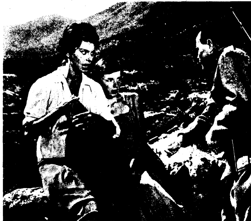
Psychological impact of wartime gang-rape on a mother and daughter was portrayed in Vittorio de Sica's film "Two Women".

Feminists of different political stripes -- from the bourgeois-feminist Anne Summers to the "Marxist-feminists" -- have elaborated different reasons for putting rape at the centre of women's oppression, but they all share a common basic