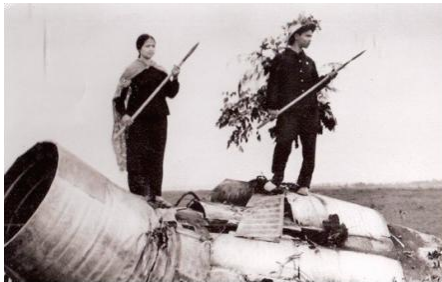
Vietnamese woman atop a downed US plane

Life on earth, I'd previously believed, consisted of millions of tiny coincidences. Now I began to understand that there was a system at work. Nothing happens spontaneously and spontaneous action cannot change the system under which human society is structured. We have to organise for change!