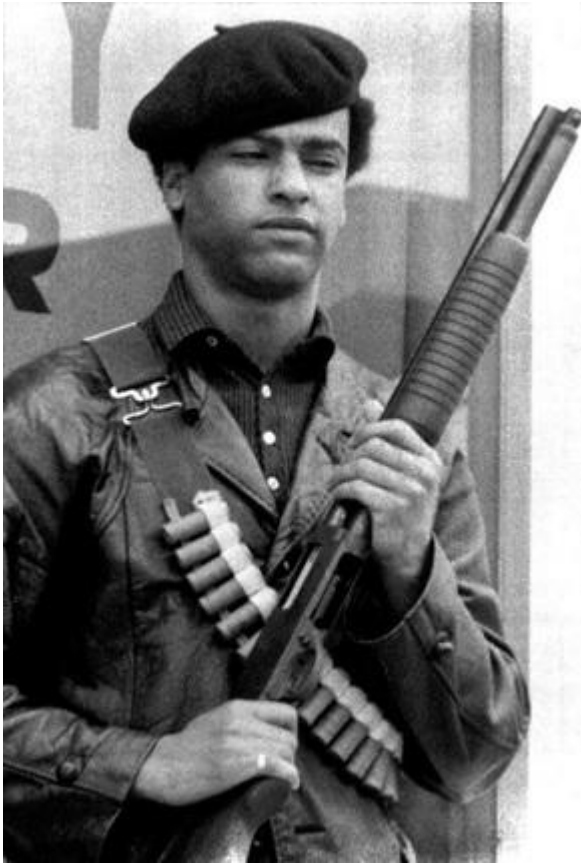
Huey P. Newton of the Black Panther Party