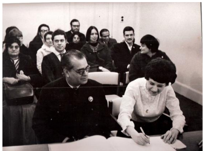
Signing the register at Hampstead Registry Office as our comrades look on.