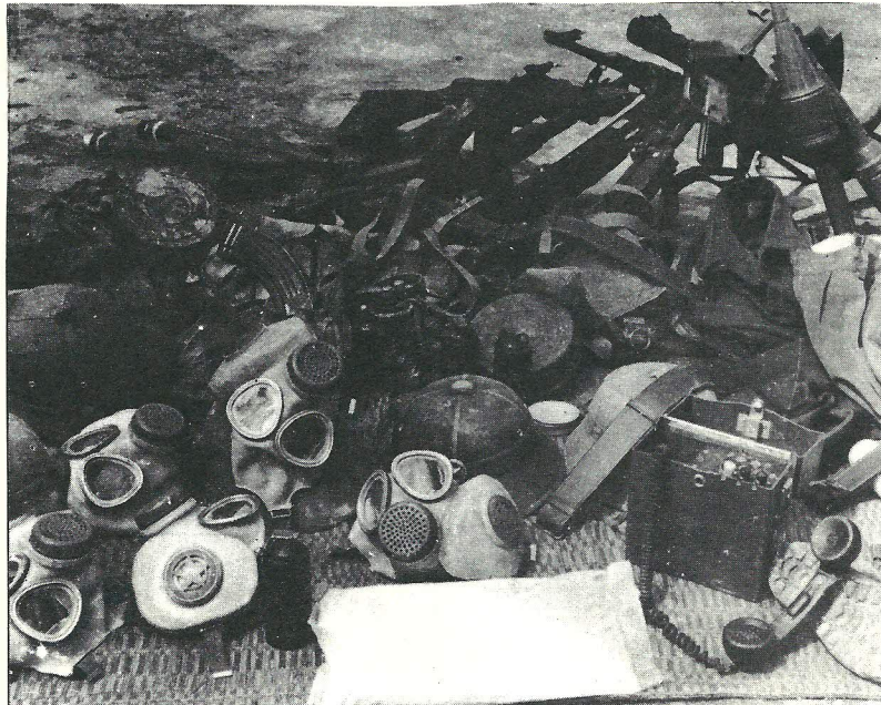
Arms and equipment taken from retreating Vietnamese soldiers

along with the world shift to the Pacific Rim axis, is in marked contrast to the isolation, poverty and backwardness of Vietnam. "Fortress Vietnam" is excluded from the world's main donor countries and organisations by her aggression in Kampuchea. A settlement there, could unlock the purses for development aid.