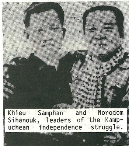
Khieu Samphan and Norodom Sihanouk, leaders of the Kampuchean independence struggle.