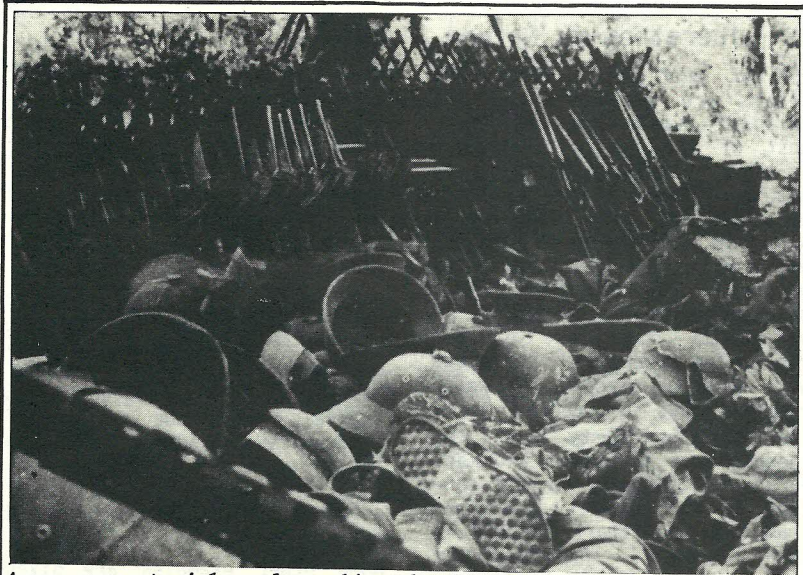
Arms, war materials and supplies abandoned by retreating Vietnamese armies after the first invasion of Democratic Kampuchea in 1978. The Vietnamese leaders have transformed their country's great liberation army of yesterday into an army attempting to subjugate other peoples of Indochina.

The focus of the Vietnamese offensive then shifted southwards, against the Khmer Rouge stronghold of Phnom Malai, a mountainous forested region, which the Vietnamese have never succeeded in completely occupying, and the place where the central government bodies of Democratic Kampuchea are concentrated. Vietnam's 59th Division drove towards Phnom Malai from the south, while the 7th and 8th Divisions moved in from the east. The aim seemed to be to hem in a considerable part of the Khmer Rouge forces and then destroy them in a con-