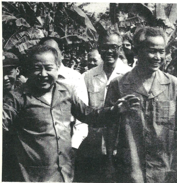
Samdech Norodom Sihanouk and Khieu Samphan

A weak, neutralised Kampuchea, rather than a strong, independent country, may better serve the interests of the superpowers and their respective allies in the region. Already, with an eye to the future, Japan has offered to pay for an international peace-keeping force after the departure of the Vietnamese and to provide re-construction aid.