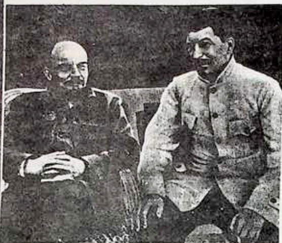
LENIN, GREAT TEACHER OF PROLETARIAN REVOLUTION, AND HIS SUCCESSOR STALIN, GREAT MARXIST-LENINIST.

SEYMOUR HALL, SEYMOUR PL. LONDON W1. (NEAREST TUBE Phone 675-1976 For Further Information) (CIRCLE ARCH).