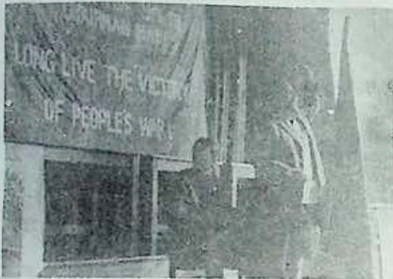
The European representative of PAC addresses the rally

On the 10th anniversary of Sharpeville Day, revolutionary people from many parts of the world held the most militant rally to be held in London for decades. The commemoration was of the Sharpeville massacre, when 72 Africans were killed and over 200 more injured by South African fascist police, who opened fire on a demonstration. The demonstration was called by the Pan Africanist Congress of Azania (S. Africa), the broad anti-imperialist, anti-revisionist movement leading the Azanian people, in militant opposition to the pass laws. This was the day when the Azanian people recognised that the only way to freedom from exploitation lay through armed struggle. The rally on March 21, chaired by the European representative of PAC, was a source of unity and inspiration to carry on the struggles for the liberation of all working and oppressed peoples.