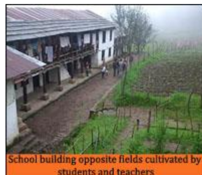
School building opposite fields cultivated by students and teachers

Our journey started, as many do in Nepal, with a five hour bus trip where the only available free space was the roof. Although the journey was long it was only just over 100km, following narrow, windy mountain roads which were bumpy and at times treacherous. The roof however provided stunning views of the scenery and the opportunity to meet many local people, including a family of seven brothers and two sisters who found us a great source of amusement but were eager for us to visit their village and stay with their family. They were very friendly and not reserved at all, especially the girls unlike in many parts of Nepal and Asia in general, but we politely told them of our need to get to the town of Jiri in Dolakha district, east of Kathmandu.