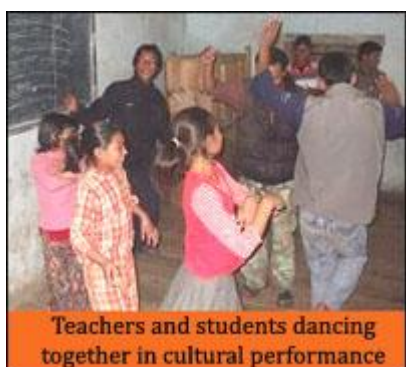
Teachers and students dancing together in cultural performance