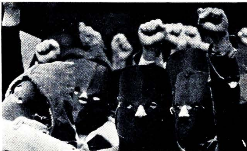
Iranian Student Association demo in Rome

Today, with a population of 30 million people, Iran has a 60,000 member secret police force (SAVAK) and an estimated 40,000 political prisoners. Additionally, Iran has a 33,000 member rural police force under the direction of US "advisory" teams. The US military admits to having at least 3,200 military and civilian Pentagon employees in Iran. Two high-ranking officials, both top US Air Force advisors, were executed recently by the Iranian Peoples' Fighters Organization in retaliation for the killing of 9 student political prisoners by SAVAK on April 19th. The presence of the US military propping up the Shah's regime is a major source of struggle among the Iranian people.