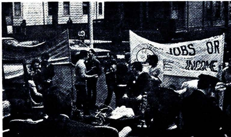
Milwaukee workers, employed & unemployed, fight eviction.

can't find it; that's 8.5 million people who could be--who want to be--providing a decent living for themselves and their families; and it's 8.5 million people who could be producing those products which the American people need so badly. At the same time, we have to understand that government figures lie a whole lot. For example, the economists speak in horrified tones about the 40% unemployment rate for Black teenagers. But under half of the potential workers in this group are even counted--the rest have not held jobs (and therefore aren't counted) or have given up even looking for work. The actual figure is much closer to 80%! And all the other figures which the government decides to put out are just as full of lies and distortions.