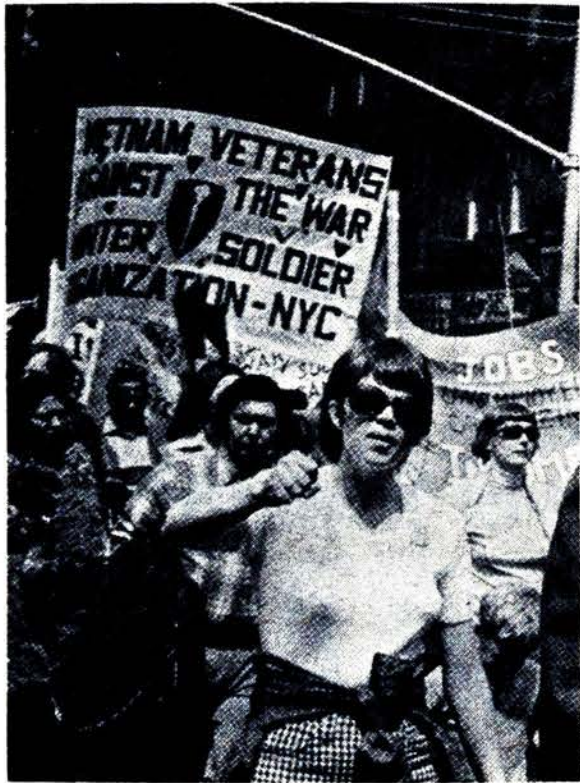
Vets contingent in NY May Day demo

May 1st is International Worker's Day, a working class holiday celebrated the world over. Here in the US, thousands of workers and other people, including veterans, united in militant marches, rallies and programs to celebrate May Day. VVAW/WSO chapters in cities across the country helped build for May Day demonstrations, including one of the largest and most successful actions, held in New York City and attended by 1200 people. Following is the text of the speech given by a VVAW/WSO member at the NYC demonstration -- a speech bringing out the lessons of the Indochina war and the fact that veterans and other working people are telling the small class of people who rule this country that we won't fight in another of their rich man's wars.