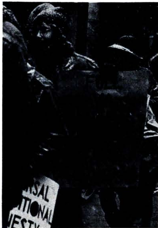
VVAW/WSO demands Decent Benefits

In the continuing series of cutbacks and attacks upon the American people, the Ford administration has broadened its economic assault to include people soon to be active duty members of the Armed Forces.