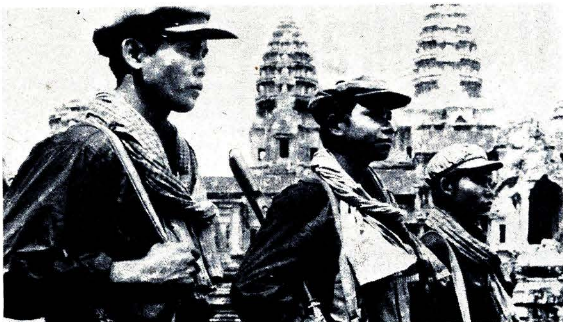
Liberation Fighters Vigilantly Standing Guard

see the Mayaguez incident as a "great victory."