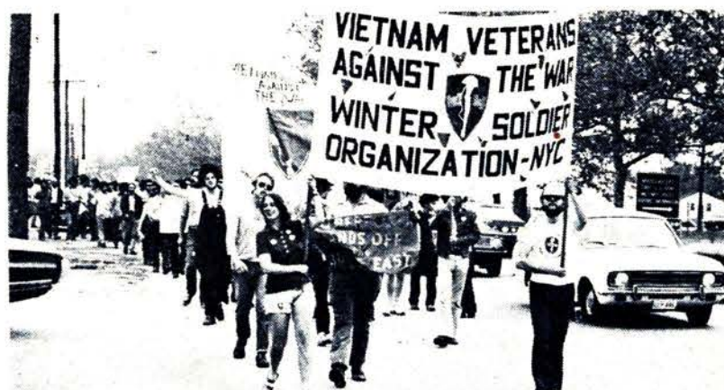
Ft. Meade, MD Armed Forces Day demonstration