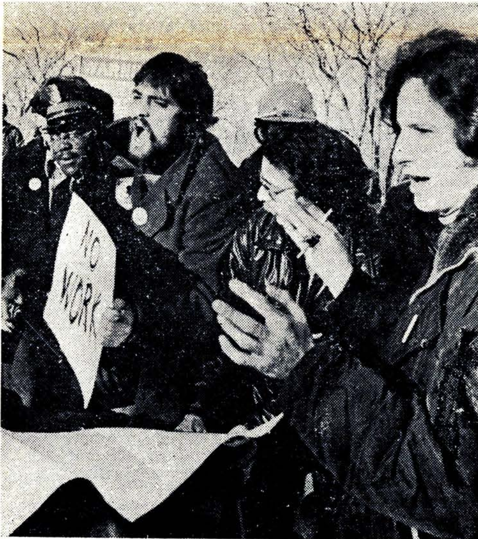
Postal Workers During 1974 Strike

A big struggle is brewing inside Post Offices all across the country as contract time approaches. The present contract between Postal workers and the United States Postal Service expires on July 20th and the fight for a good contract in 1975 is growing. It's going to be one hell of a fight because the Postal workers aren't going to let the economic crisis of the Postal Corporation end up on the workers' backs. The Postal Corporation is facing an $820 million deficit, which means they will be fighting against the workers with everything they've got. Also, the Postmaster General is using this deficit as an excuse for plans to lay off at least 50,000 workers over a period of five years, and some estimates for layoffs reach as high as 200,000 workers--or 1/3 of the total work force. Going along with the planned layoffs are efforts to re-double productivity campaigns, even though they are already the most intense in Post Office history.