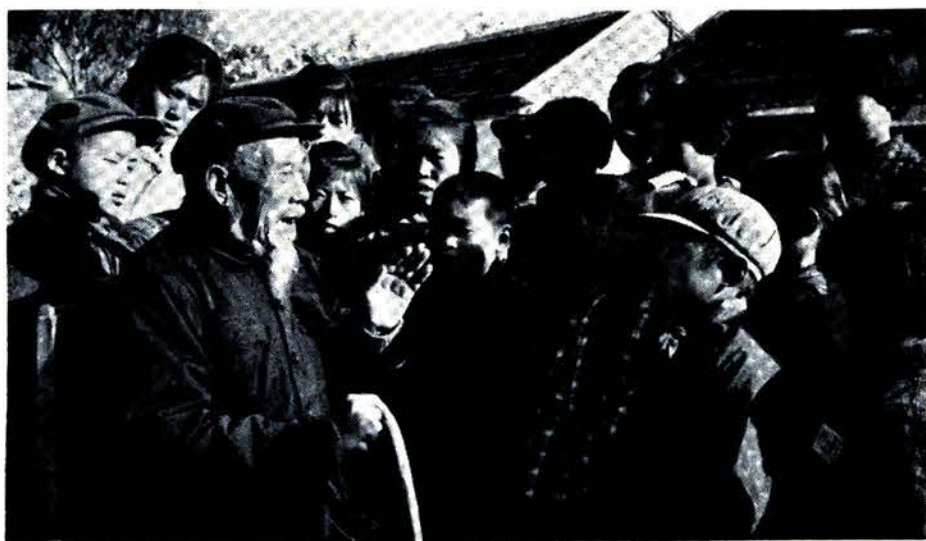
Older generation draws lessons from the past for Chinese youth.

Drug addiction is at plague proportions in the United States. Thousands of people die every year from over doses. The number of addicts on hard drugs is in the millions. For veterans in particular, the Indochina war made more addicts than deaths in combat or deaths by accident. Sources estimate the Vietnam veterans drug addiction total to be somewhere close to 200,000.