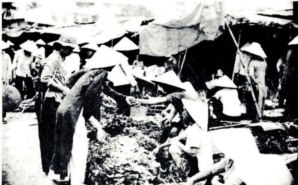
Marketplace in Hue after liberation

The Vietnamese revolutionary fighters have won their war for freedom and independence. Since overthrowing the US imperialists and their puppet regime in Saigon on April 31, the workers and peasants, guided by the Provisional Revolutionary Government (PRG) are consolidating their victory and wiping out the last remnants of over a century of exploitation by France, Japan and the US.