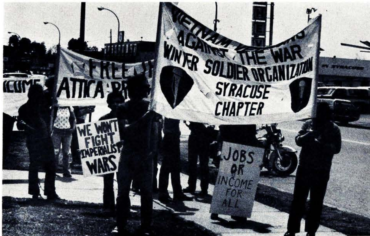
Armed Forces Day Support Demo in Syracuse

Sending a part of the demonstrators to set up a picket line at a liquor store near the post's main gate (that sells scab Gallo wine to GIs), the rest of the demonstrators broke down into small teams and hit the base. These teams went to pre-arranged unit barracks on post, talking with GIs about why the demonstration was being held, about the danger of a new war and why GIs had to fight against being used as the cannon fodder to fight it, and about the struggles Meade GIs have with the bullshit conditions and harassment there. A number of these teams were caught and jacked around by the MP's anti-VVAW/WSO patrols but the majority didn't and managed to spend a lot of time rapping with people and distributing copies of Highway 13 , the project newspaper. While the Brass had expected some people to try and get into the various unit areas they were totally surprised when a number of VVAW/WSO women went into the WAC barracks and spent a good part of the morning talking with the WACs. The WACs were quick to lay out what they thought of life in the "new action army" and it wasn't very much. In other unit areas, demonstrators went in and were enthusiastically greeted by the GIs there. Typical was the response of one GI who said, "Oh, we know all about the demo today, and are all for it."