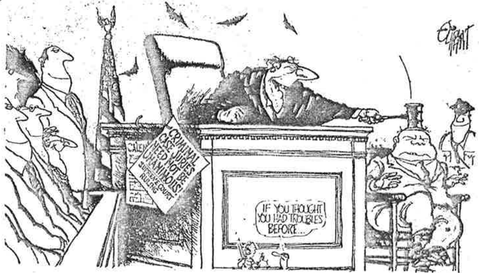
"Eight to four? That's enough of a majority — 30 years!"

If McGovern does become President and does end the war, it will be because the American and Vietnamese people force him to end it. The people's opposition to the war, coupled with the heroic victories of the Vietnamese, forced Johnson out of office and have forced Nixon to withdraw troops. The only way the Vietnam war, or any unjust war, will be ended is by continuing the opposition of the people.