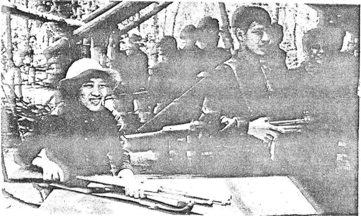
NLF cadre preparing for battle at secret base camp.