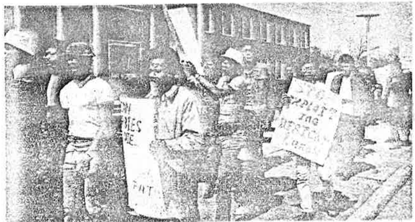
Students at Lincoln University in Pennsylvania protest Foote Mineral Company's importation of Rhodesian chrome ore.