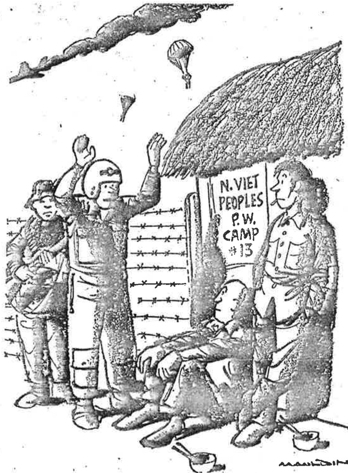
"Nixon couldn't get you guys out, so he's sending you company."