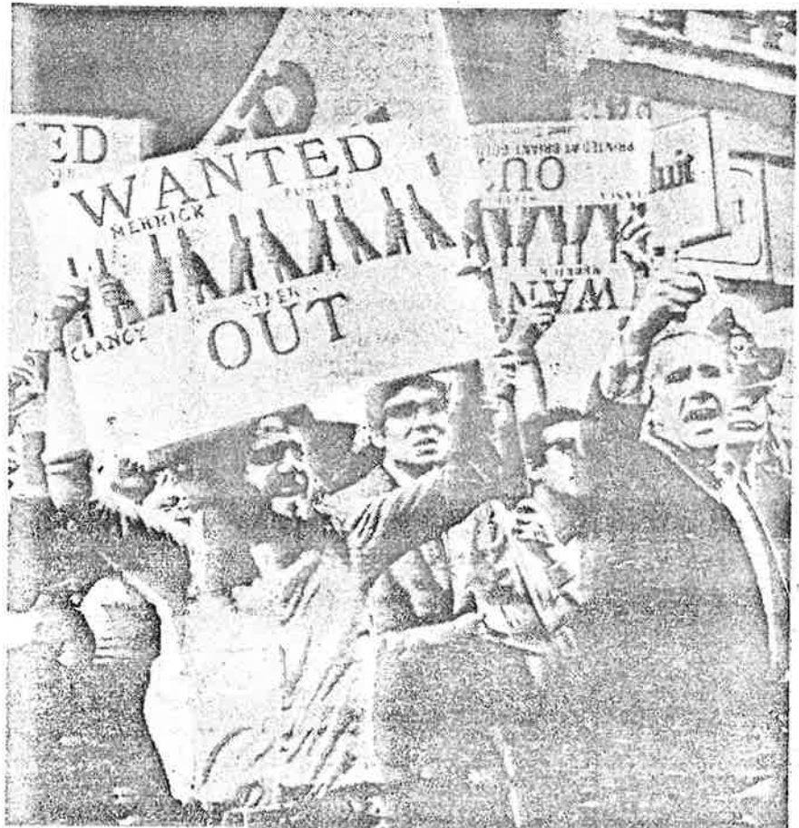
British workers demonstrating support for arrested dockers