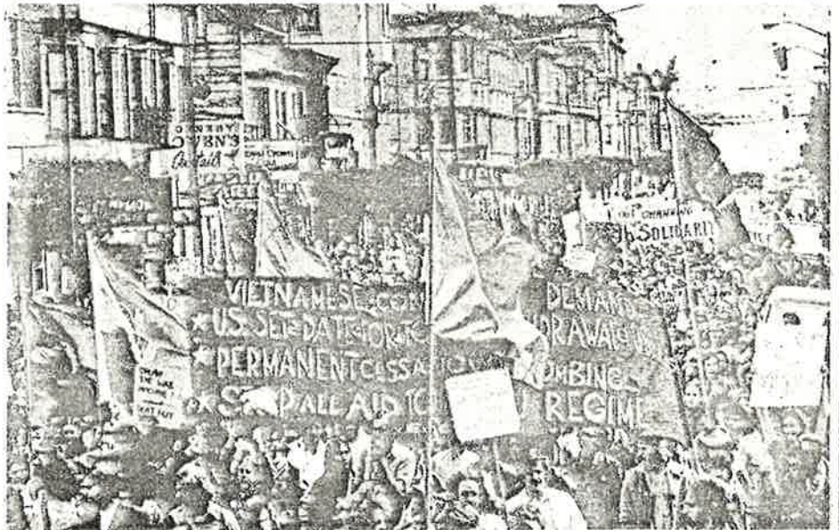
Over 30,000 demonstrators in San Francisco April 22 in protest against the Vietnam war.

One wing of the ruling class, represented by Nixon, still hopes for a military victory in Vietnam. This group thinks that the best way to maintain U.S. interests around the world is with military strength, bullying other nations into submission. The other wing of the ruling class, represented by McGovern, wants the U.S. to assume a less militaristic appearance while maintaining U.S. interests mainly through political and economic pressure.