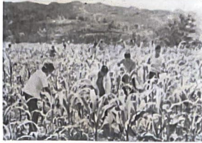
Thriving crops on fields formerly under-dry.