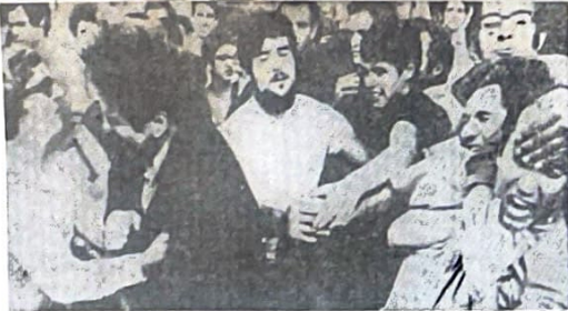
ANTI-ZIONIST JEWISH STUDENTS AT HEBREW UNIVERSITY, TEL AVIV, ISRAEL, BRAVELY FIGHT AGAINST THE ATTACKS OF THE ZIONIST FASCISTS AND PROUDLY UPHOLD THE FUNDAMENTAL RIGHT OF THE PALESTINIAN PEOPLE TO OVERTHROW ZIONIST RULE AND ESTABLISH A PEOPLE'S DEMOCRATIC PALESTINE, PROUDLY RAISING THE PALESTINIAN NATIONAL FLAG, 1,000 STUDENTS HELD THIS VIGOROUS RALLY NOV. 17.

Progressive Jewish students at the Hebrew University in Tel Aviv, Israel, recently raised Palestinian flags on campus and denounced and fought with their fists against fascist Zionist students. On November 17, progressive students confronted the university administration and the Zionists in the student body and denounced the fascist atrocities committed against the Palestinian people. One thousand students attended this rally.