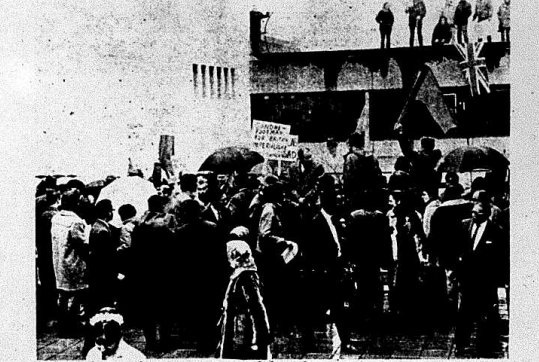
Members and Canadian supporters of the Ad-Hoc Committee for the Hindustani Ghandi Party at Simon Fraser University showed their utter contempt for the imperialist lackey Ghandi.