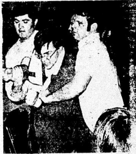
Dozens of hired thugs and police in Winnipeg assaulted the Canadian patriots who demanded that Rene Levesque explain why he does not support the Quebec national liberation struggle.

The Party's COMMISSION ON YOUTH AND STUDENTS has actively participated in summing up the experience of the revolutionary work of the youth and students during the weekend of August 29-30 and has endorsed the following call of the Party.