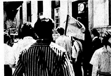
Photo shows militant demonstration against U.S. imperialist consulate on August 7th., organised by the Afro-Asian Peoples' Solidarity Movement to condemn their policies of aggression and genocide against the Asian people.