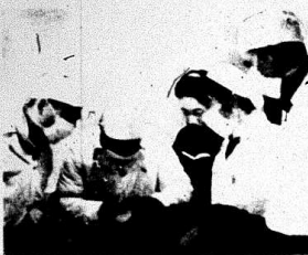
Treating an eye ailment with a new acupuncture method.

The new process contains new contradictions and begins its own history of the development of contradictions.