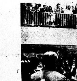
Hundreds of students at Dalhousie University in Halifax last year participated in this mass democracy meeting organized by the Dalhousie Student Movement to denounce and repudiate the student council hacks who were trying, with the aid of hired goons, to suppress the right to disseminate Mao Tsetung Thought.