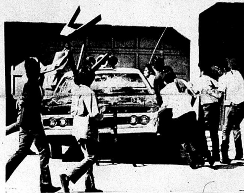
East Los Angeles Mexican-Americans using revolutionary violence to oppose counter-revolutionary violence.