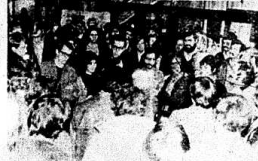
Revolutionary students at the University of B.C. held a mass democracy meeting right into the offices of the student council hacks to denounce them for attempting to suppress the Academic Activities Committee.