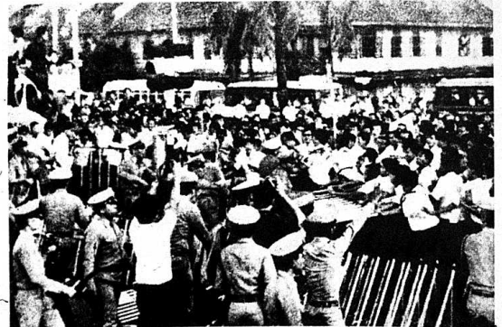
In Bangkok, thousands of students took to the streets to carry out a mammoth demonstration against U.S. imperialism and the Thanom clique. Demonstrating students fight valiantly against reactionary policemen called out to suppress them.

Recently, instigated by U.S. imperialism, the Thanom clique decided to send troops to help the U.S. imperialists invade Cambodia and extend their war of aggression to the whole of Indo-China. The Thai patriotic armed forces and people launched wide-spread attacks and dealt a telling blow at U.S. imperialism and its lackey, the Thanom clique, rendering active support to the three Indo-Chinese peoples in their war of resistance against U.S. imperialism and for national salvation. Persevering in protracted people's war, the Thai patriotic armed forces and people are determined to overthrow the reactionary rule of the traitorous Thanom clique and drive all the U.S. pirates out of Thailand. (LEFT) Reactionary troops of the Thanom clique badly battered by Thai people's armed forces. (RIGHT) In Bangkok, thousands of students take to the streets to carry out a mammoth demonstration against U.S. imperialism and the Thanom clique. Demonstrating students fight valiantly against reactionary policemen called out to suppress them.