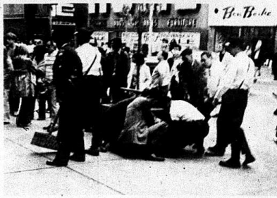
right) while defending his democratic right to demonstrate. The police then washed away the blood, evidence of their crimes, in order to fool the masses as to the real occurrence October 10th.