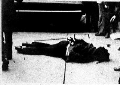
Hamilton, October 10th. One of the staunch supporters of the struggle of the leading spokesman of the CPC (ML) lies manacled and bleeding on King Street in Hamilton (photo left). He was viciously assaulted by 8 fascist Hamilton police (photo