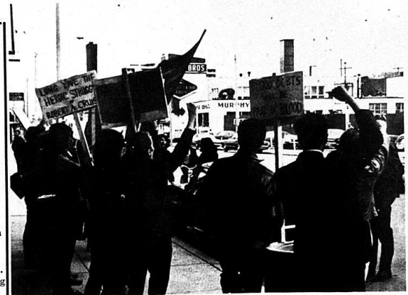
Hamilton, October 10th. The beginnings of a vigorous rally at the Provincial Judges Court in Hamilton (photos 1 & 2, page 1). The demonstrators then began marching into downtown Hamilton (photo 3, page 3) and then turned onto King street (photos 4 & 5, page 3) where the Hamilton police organized a frenzied attack in an attempt to keep the facts from the masses. Under the instigation of the RCMP, over 41 charges were laid and bail was raised from a total of $3000 to over $13,000.