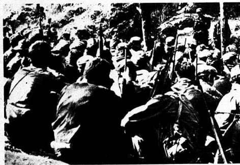
(ABOVE) Fighters of a Thai People's Liberation Army unit at a meeting.

The Thai People's Liberation Army is a true army of the sons of the people and an army which serves the people wholly and entirely. The men of the PLA put in long hours of work, ploughing fields, giving medical treatment, if needed, and repairing houses. (BELOW) The Thai PLA forces resolutely put into practice the policy of self-reliance and between battles, the fighters take an active part in productive labour.