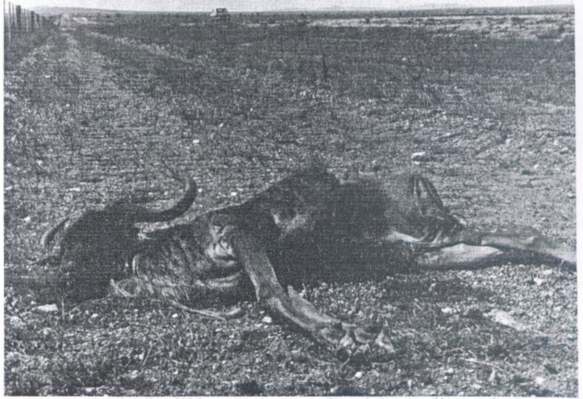
The scramble for profit kills wild life to promote tourism. Since the banning of big game hunting by the Kenyan Government the profiteers rely on poaching.

What are we to make of Hua's visit to Yugoslavia and embracing of Tito in 1978?