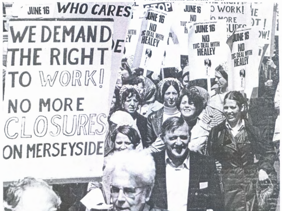
Workers in Liverpool march against unemployment. A Labour Government promised to reduce unemployment in exchange for wage restraint. We've had wage restraint but unemployment has gone up to two million!

If Chrysler workers really work on these demands, the echoes will put the wind up every speculator and whizzkid who will find that playing with people's jobs is playing with fire.