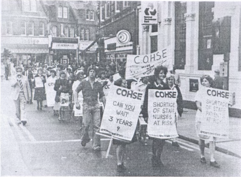
COHSE workers on the march to protest against the shortage of staff and the running down of the NHS