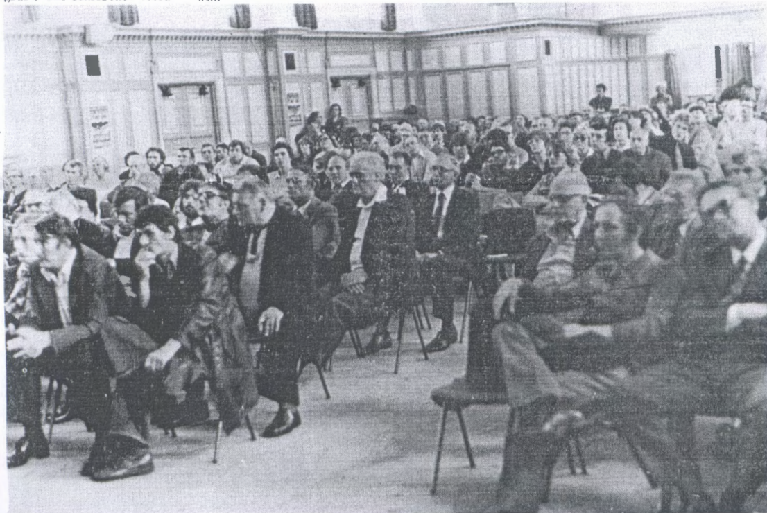
Meeting of dockers at East Ham Town Hall on June 28th against the closure of London Docks.

"In fighting, both on the plains and in the mountains, man is the decisive factor that determines the fate of the battle, regardless of the development of armaments. A smaller army can defeat a greater army, superior in manpower and means, when this small army wages a just war and when all those comprising it are politically clear about the just nature of the war they are waging, indissolubly united in their determination to achieve victory over the enemy, resolved to the end to shed their blood to the last drop for this purpose; and well trained to overcome all the difficulties of the war. In the field of battle man can replace the weapon, but the weapon can never eliminate the role of man: without man a weapon is nothing but a dead piece of iron, lifeless and powerless."