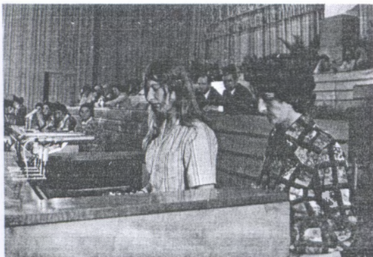
CPB(ML) delegate to the Congress of the Albanian Women's Union addresses the meeting.

'This Trades Union Council opposes any Phase 4 of wages policy and opposes all restrictions in any form on collective bargaining by any government.'