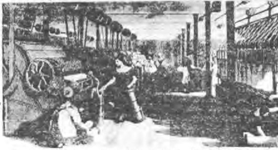
Heyday of the Industrial Revolution in the North West. A Manchester cotton mill.

All workers in other industries must seek to learn from these examples, not least the construction workers whose weapons for struggle against the Social Contract were wrenched from their grasp. In this corner of the country alone we have the skills to generate enough electrical power to supply the whole world, resources sufficient to restore and re-equip the entire railway and underground railway systems of Britain, and the technology which could defend the nation from any form of external military attack - nuclear or otherwise. History has imbued us with a sense of proletarian discipline that is among the most extensive and intensive in the land, and we have a further advantage of knowing that capitalism is so corrupt that it would destroy all these assets in order to retain political power. It is only fitting then that we should now use our intelligence to grasp the immense potential that we have created of ourselves, and the one future that capitalism's logic has brought us to - the inevitability of revolution.