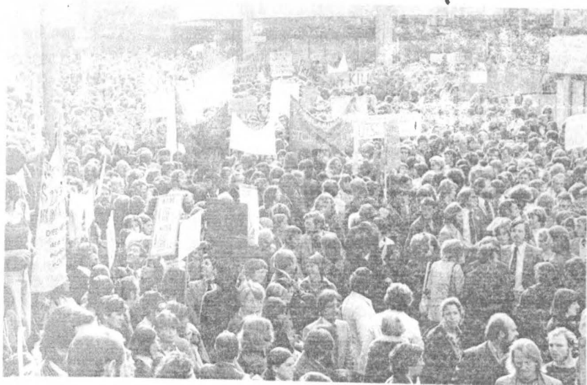
Four thousand people assembled in Oxford on September 21st in defence of education. The council which was discussing its education budget on the day was forced to defer its decision.

But what does it matter if we lose our education through the agency of the 'lesser' or the 'greater' of the two evils, if they can be so distinguished? In truth there is only one evil, a ruling class which cannot live with education or any other advance for workers. The best way to learn from the workers in Oxfordshire (see last issue of The Worker), is not by applauding from the side line but by the active defence of education against all comers. Dare to fight for education.