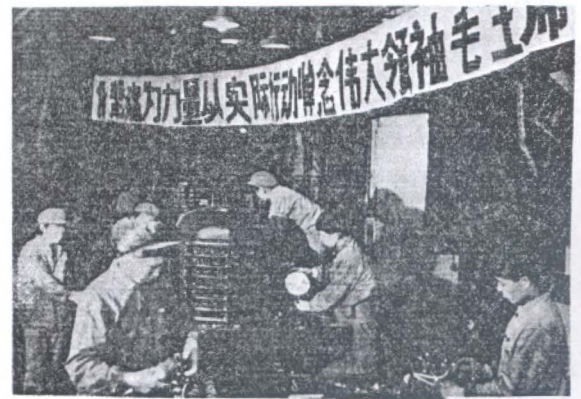
Workers and cadres at the Changchun No. 1 Motor Vehicle Plant in north east China mourn the death of Mao Tse Tung with concrete deeds. Production is lifted and the workers are more acute in their political activity.

Workers made redundant from a newspaper will be made redundant from the industry. Retired workers will not be replaced. This is the intention. We must oppose the closure of newspapers, oppose any redundancies. The well-established organised workers in print and publishing, with such a historic fighting tradition, should use their well-oiled machine to fight now for the right to work, with the knowledge that this is a fight for revolution and the end of capitalism. Workers will make much better use of Fleet Street.