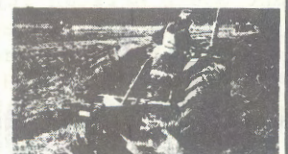
AGRICULTURE —To the farmer—The new T109 Rear Tractor Tyre by Dunlop is the only one of its type in the world—made specifically for Rhodesian conditions