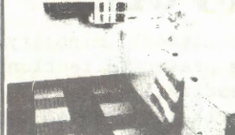
TILES —To the housewife—Dunlop Vinyl Floor Tiles in a wide choice of attractive colours are available from Art Flooring Co. (Pvt.) Ltd