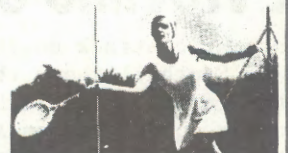
SPORT —To the Sportsmen—Dunlop is golf, squash, tennis—Dunlop plays a part in your favourite sport.

DUNLOP of real importance to the Rhodesian Way of Life