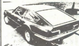
TYRES —To the motorist—Dunlop means safety, and long-lasting tyres developed over years of research S.P. Black Belted Radials and Dunlop Tough Tested Truck Tyres