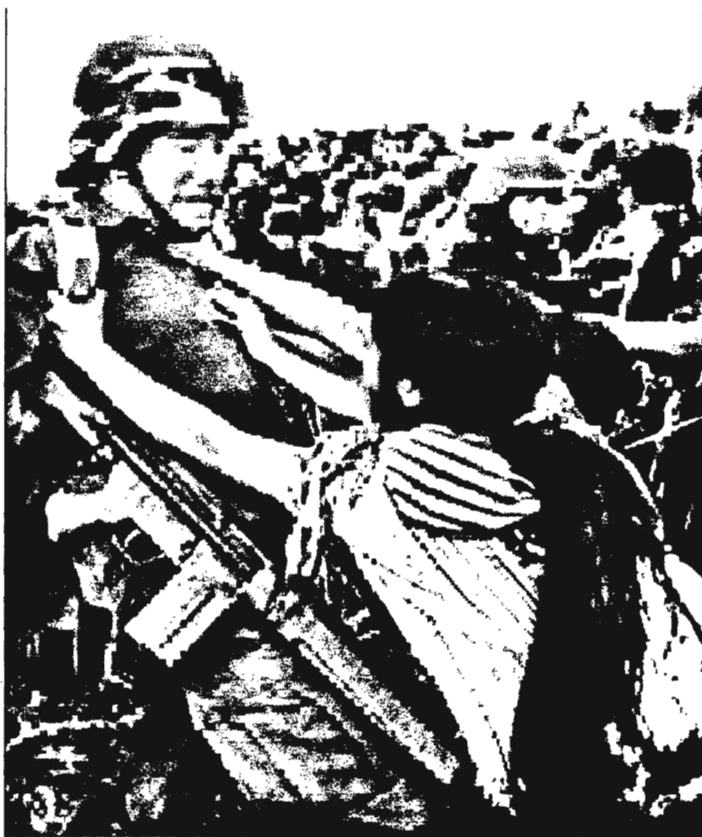
Indigenous women hold back troops trying to enter the town of X'Oyep in Chiapas on Jan. 3, 1998

Instead, the government has continued to carry out repression and a press campaign to weaken the political influence of the Zapatistas and other forces fighting in Chiapas. The government accused Bishop Samuel Ruiz and his human rights organization of being "frontmen" for the EZLN and of exaggerating the problems in Chiapas. Government press releases and interviews have painted