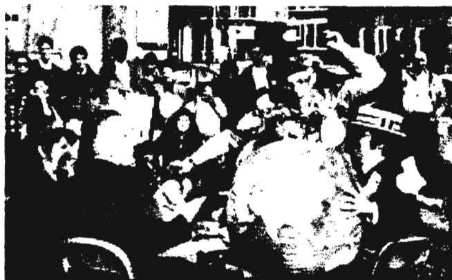
George Bush, American Capitalism and General Schwarzkopf in a May Day skit in Chicago, 1991

The MLP pushed the mass movements, pressured