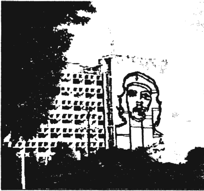
Che's image on the Ministry of Justice Building, Havana

overeducation of the people, and the fact that fuel shortage has arrested mechanization, Cuba is having trouble recruiting sugar cane workers. Supposedly, the government has been forced to double wages for cane-cutters. An interesting phenomenon is the considerable outmigration from the cities to the countryside of urbanites, including women, seeking employment on the private farms.