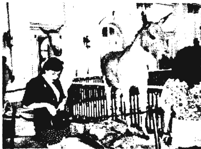
Che's mules, stuffed and on display

Yes, Che is everywhere -- on the billboards, on the buildings, on the currency, in the bookstores, and in many museums. The Che t-shirts, posters, paintings and postcards seem geared toward the tourist trade. In fact, the Museum of the Revolution (the old Batista palace) is almost as much devoted to Che alone as it is to the total Revolution. Every scrap of his personal possessions -- bloodied, bullet-ridden clothing, utensils, guitar, radio, etc. -- has been preserved. Even the mules which carried his