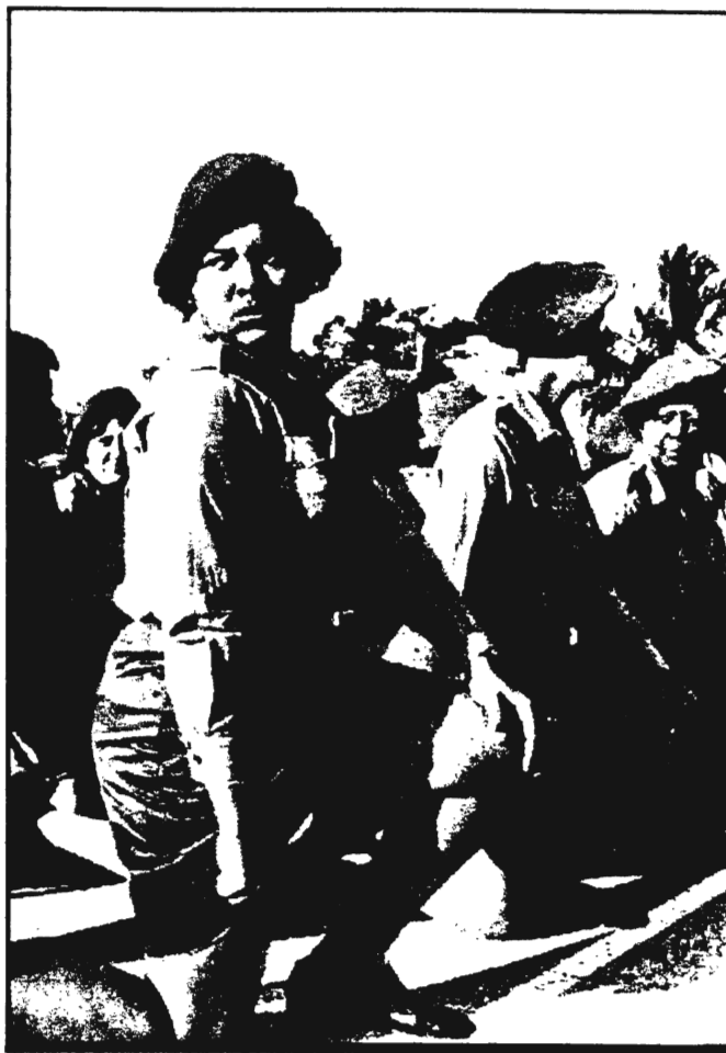
"Juramos", circa 1980, from a Cuban postcard

It is a platitude that the situation in Cuba is not a carbon copy of the USSR or of Eastern Europe, but I personally feel that there is much more serious work to be done besides relying on bourgeois appraisals of Cuba, before one can "advise" the Cuban masses how to be "revolutionary." One intriguing thing: when we asked people where the "well-to-do" lived, we got nothing but blank responses. Perhaps a place to start would be to do some investigation on the strata of Cuban bourgeoisie: