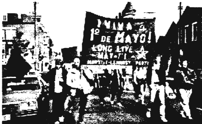
MLP May Day March, 1991

MLP members withstood arrests, imprisonment and political persecutions, and in addition to these heroic sacrifices, most MLP members made tremendous personal sacrifices every day for many years: forsaking careers of any kind, suffering material hardships in order to provide financial support for their party, and risking the alienation of family, friends and community. These were and are the constant sacrifices that all serious communist