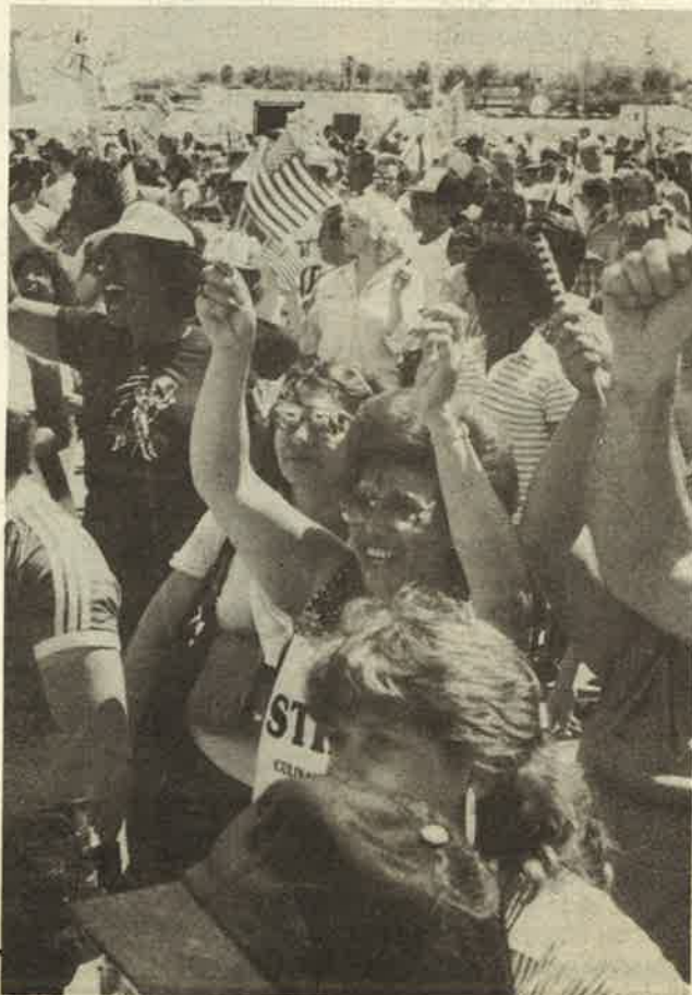
The Las Vegas hotel workers were on the front line of the fight against union-busting and concessions. (Above) Strikers and labor supporters in Las Vegas, April 15, 1984.

These demands are partially realizable at present, but socialism will be necessary to realize them in a genuine and full way