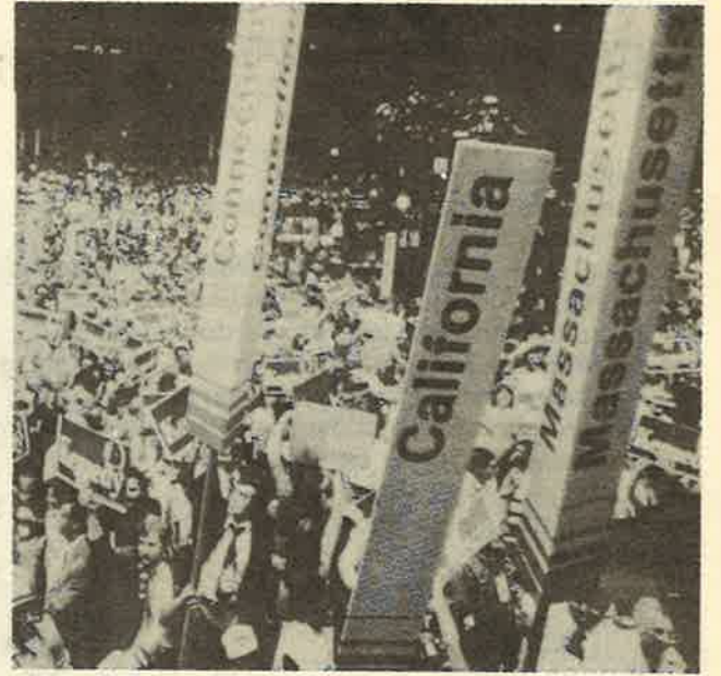
The capitalists' two-party system makes a show of democracy while restricting participation to a few. End the two-party monopoly! Full voting rights for all oppressed nationalities!