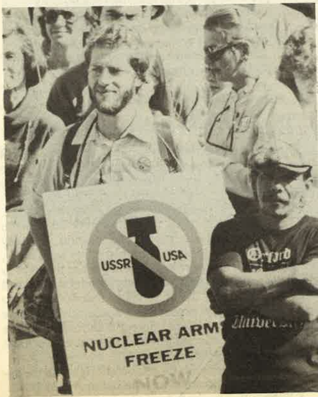
Negotiate immediately with the Soviet Union to freeze, reduce and abolish all nuclear weapons!