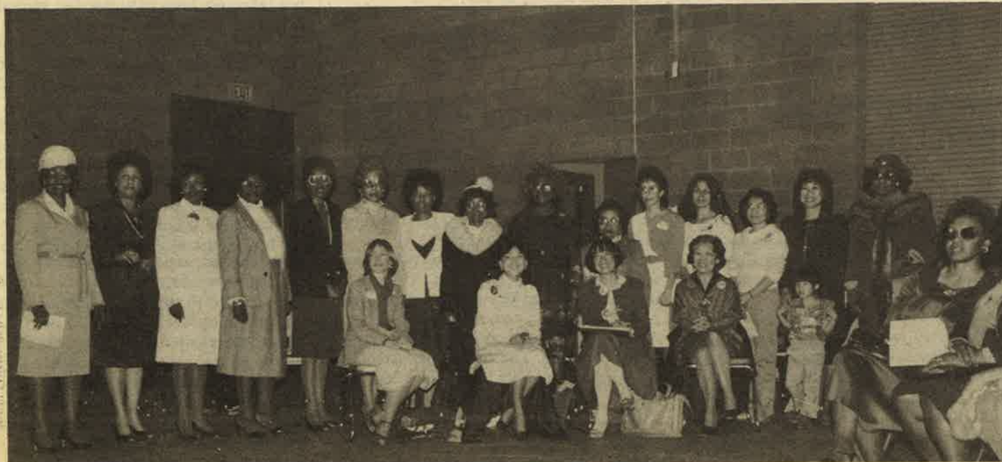
Leaders and participants at the "Women 4" Jackson at a San Francisco rally that attracted over 500 people.

We had observed earlier that there were many black nationalists as well as traditional petty bourgeois electoral types in the Jackson campaign. We also urged the left, in general, to get more deeply involved with the campaign to offset this presence. Farrakhan, head of the Nation of Islam, now presenting himself as a "messenger of the honorable Elijah Muhammad" is such a nationalist. And while we condemn nationalism generally, we must observe that we support nationalists when they fight against imperialism. Farrakhan's recent campaign to bring nationalists, particularly black muslims, into the voting booth to participate in electoral politics is positive. But obviously threats on Coleman and ambiguous statements about Hitler play into the bourgeoisie's hands. Though, for certain, Farrakhan's words have been distorted. Farrakhan did denounce Hitler as a "wicked man" and said he didn't want to be associated with him. But he did say Hitler was "a great german." Hitler was a fascist,