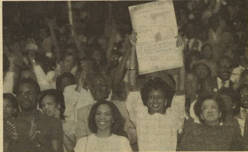
Supporters cheer Jackson in Tennessee

The flood of articles attacking Jackson, which represents a distinct change from the earlier bourgeois stance of trying to ignore him, indicates how upset the bourgeoisie is. Not only because of the black mobilization which can have a major impact on US politics, not just in presidential politics, but because the mobilization can be used by local forces to elect black candidates and progressive candidates all across the country!!! The spectre of a real "Rainbow Coalition" emerging in this country is truly terrifying to the bourgeoisie. Because it is the segregation of the peoples of the US, particularly of