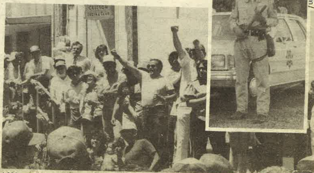
1,200 people rallied to support Phelps-Dodge strikers May 5.