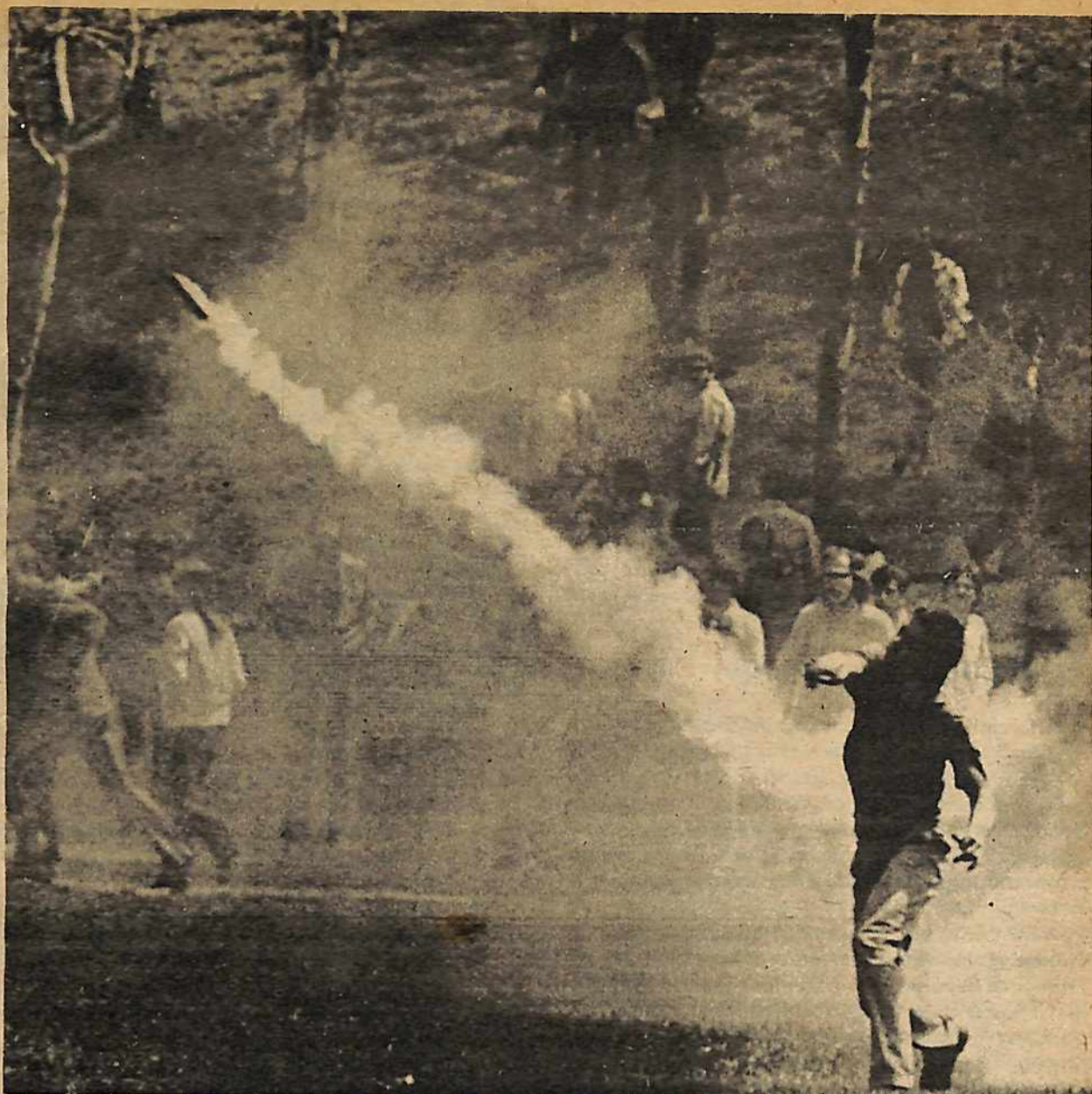
Students and youth have historically been in the forefront of the peoples' struggles against the imperialists, fighting boldly and militantly. In the '60s, they were a catalyst for the mass movements that exploded in opposition to the oppression of Blacks and the war in Vietnam.