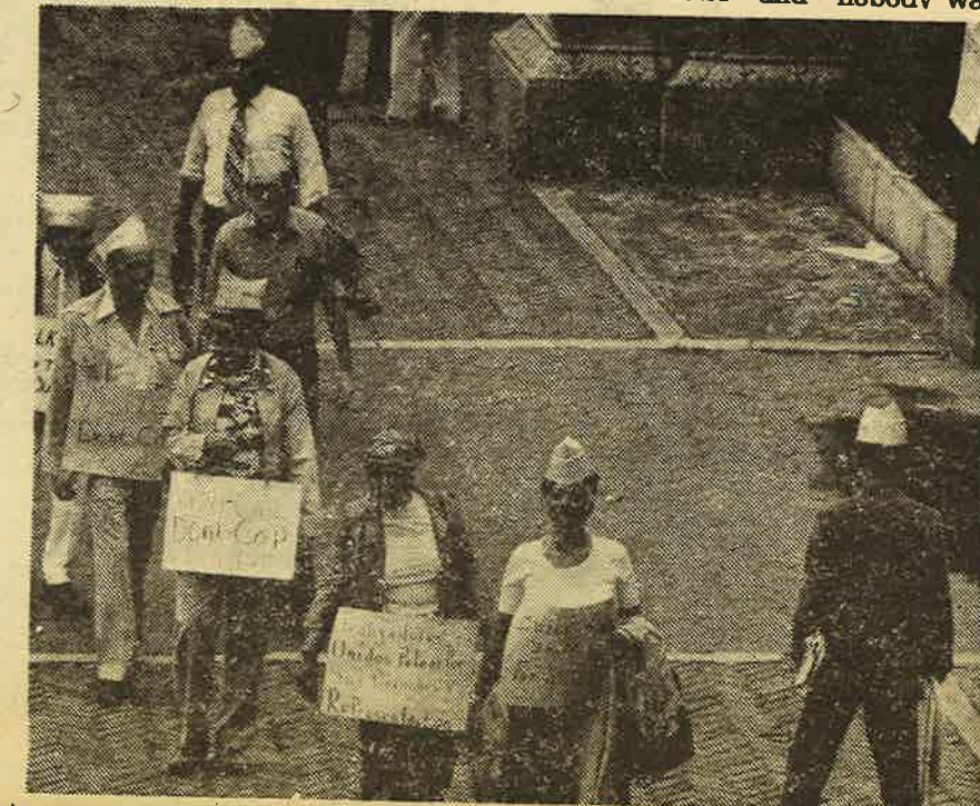
Some of the 1050 workers on strike against Columbia University in N. Y. C.

should be organizing their members to fight it with everything they've got. This is what communist leadership in the union does.