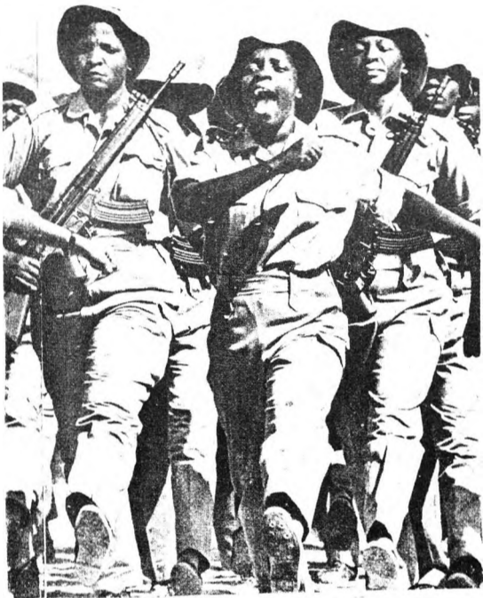
women from mozambique

"Aren't women expected to cook, clean and care for the children and men?" "Isn't that their duties as women?" If we examine the situation and lives of women in other countries, we get a totally different picture.