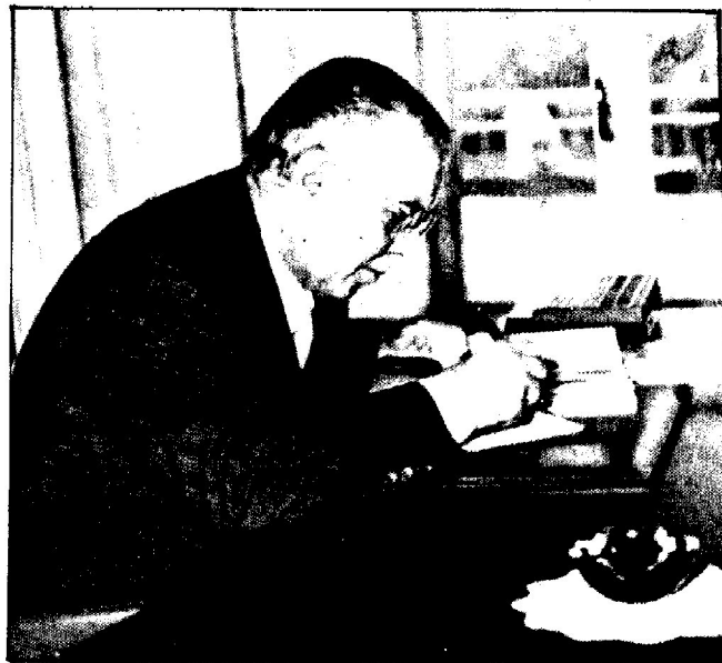
Enver Hoxha, First Secretary of the Central Committee of the Party of Labour of Albania.

From the very first pages the book "Reflections on the Middle East" is interesting for it reflects completely, accurately and with scientific objectiveness the major political, economic and social events during the last 25 years, and it contains profound analyses and important conclusions and teachings. Following the events that have taken place in the Middle East and writing about them in the moments when they have occurred, the author makes an all-round analysis of them based on historical materialism and the fundamental principles of Marxism-Leninism, discovers the internal and external causes, their complexity and interconnection, and makes assessments and predictions, the accuracy of which have been fully confirmed by the development of events in