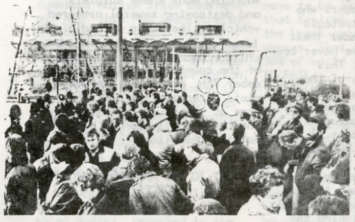
Demonstration by over 1,000 workers outside West Thurrock power station in Essex where the power workers are taking sympathy action in support of the miners.

As the strike has progressed the monopoly capitalist government, presently wielded by Thatcher and the Conservative Party, has steadily heaped on the burden of anti-worker Trade