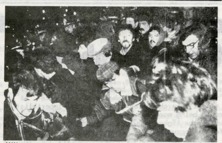
Militant mass picket by miners at Nantgarw colliery in South Wales on November 12.

Union and Employment legislation, which successive governments have been imposing to erode workers' democratic rights and fascise society and the state. Now the miners' union, for justly refusing to pay out £200,000 in court fines, has had its entire funds sequestrated by the government, technically wiping out the entire existence of the trade union.